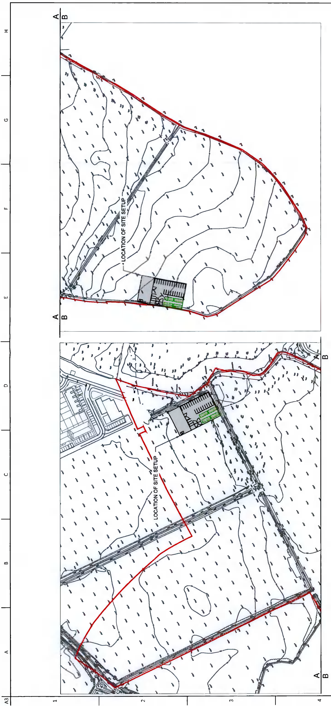
SITE PLAN 1:2000@A3