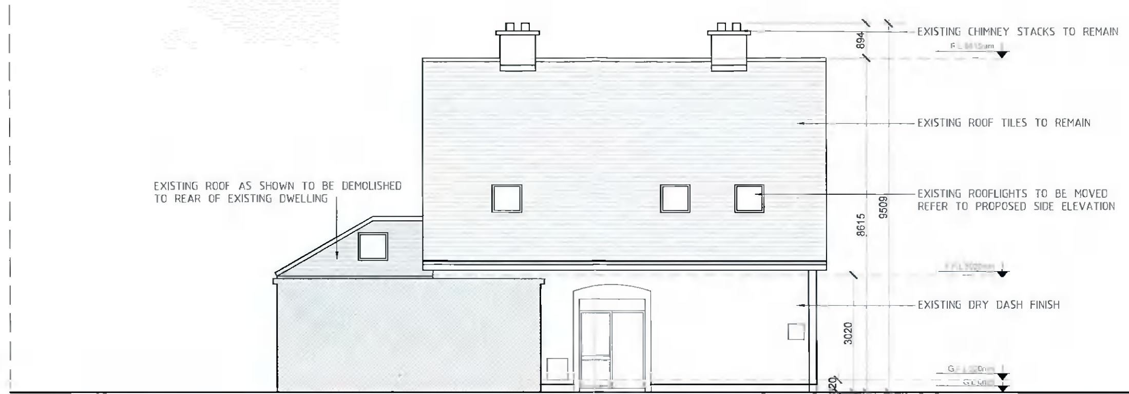
01 EXISTING SIDE ELEVATION B SCALE: 1:100