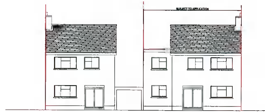
PROPOSED STREETSCAPE ELEVATION