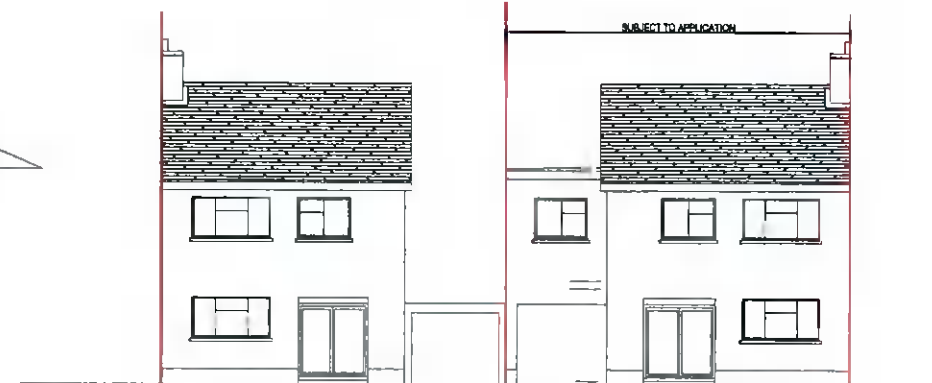
EXISTING STREETSCAPE ELEVATION SCALE 1:200