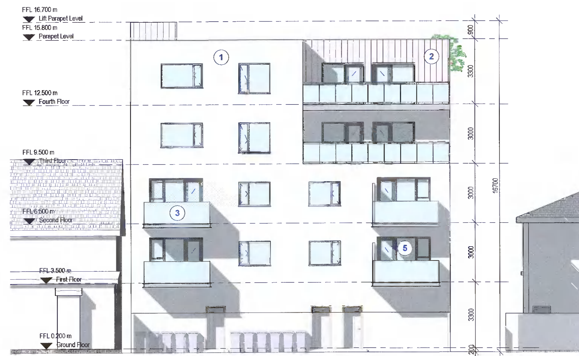
2 PROPOSED REAR ELEVATION (SOUTH FACING) SCALE 1: 100