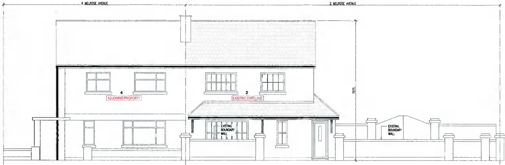
EXISTING FRONT STREET ELEVATION SCALE 1:500(A1 1:1000(A3))