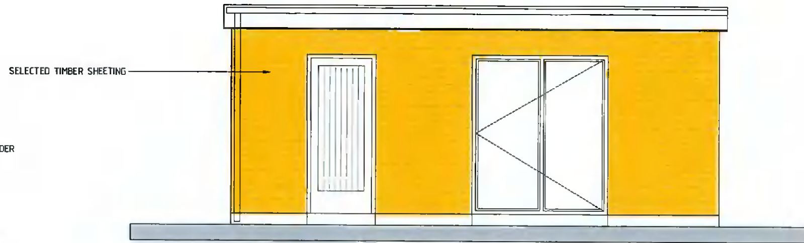
2 ELEVATION TO GARDEN Scale: 1:50