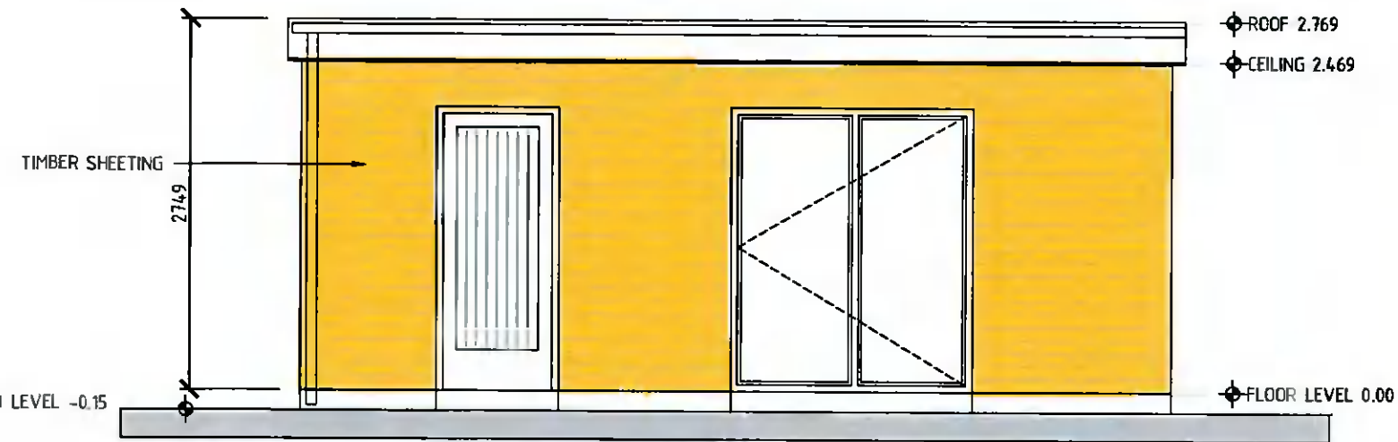
2 ELEVATION TO GARDEN Scale: 1:50