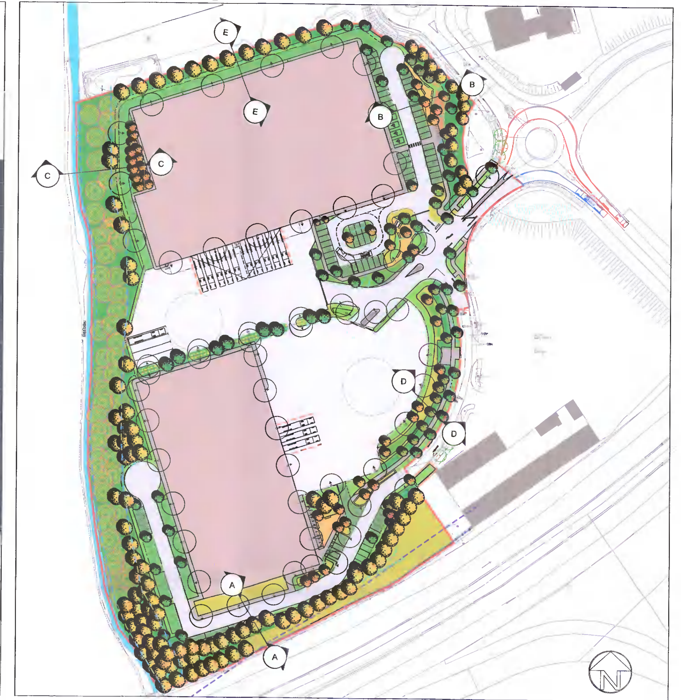
Key Plan scale 1:1000@A1