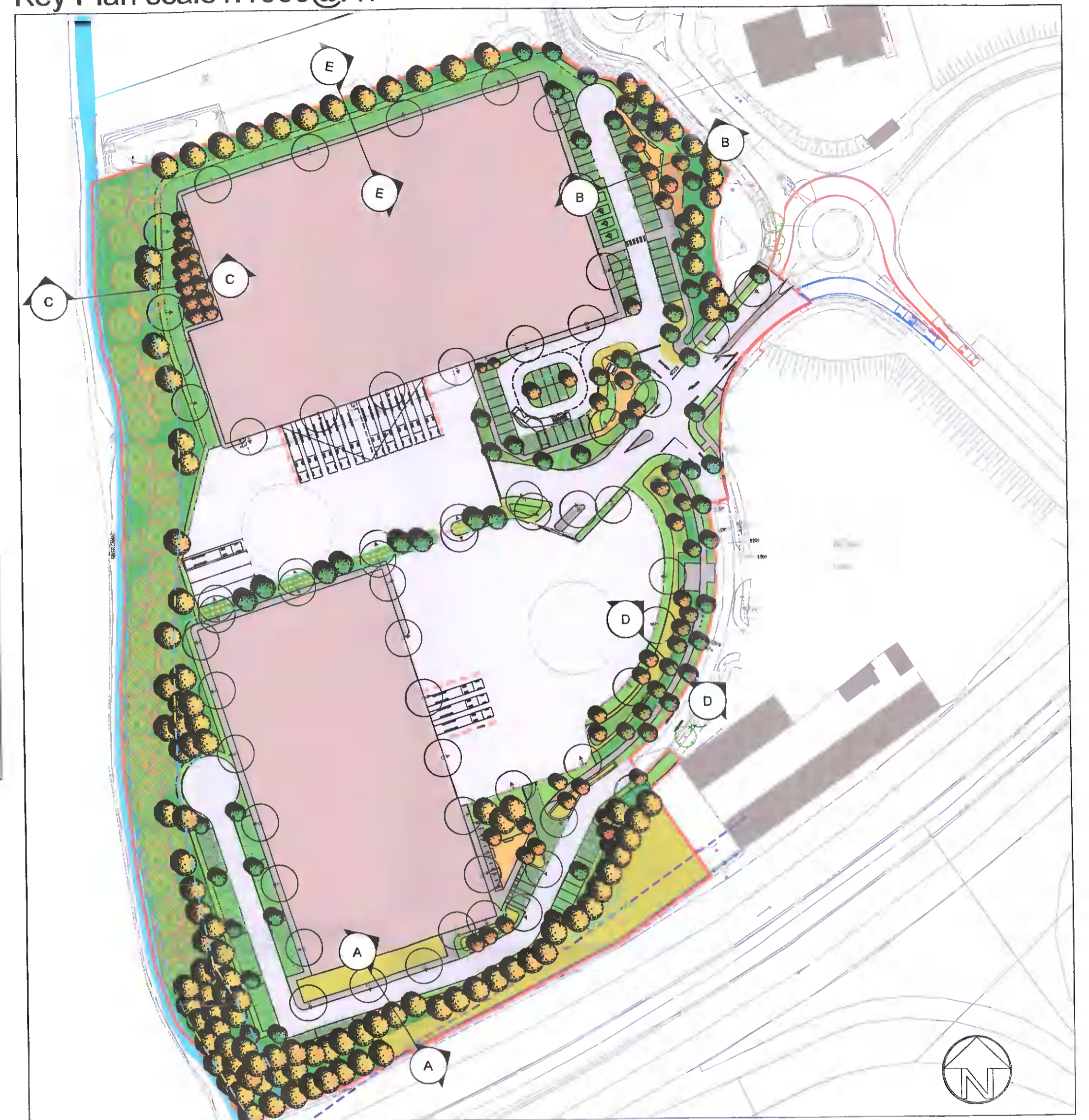
Key Plan scale 1:1000@A1