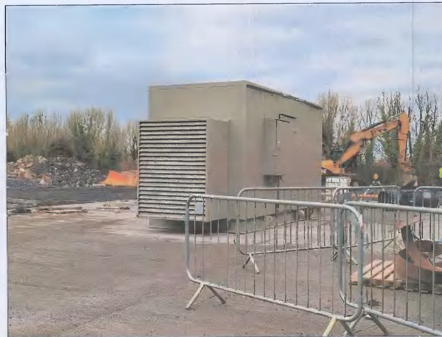
PICTURE 2: GENERATOR (AS DELIVERED ON SITE - TO BE PLACED AT THE SHOWN LOCATION)