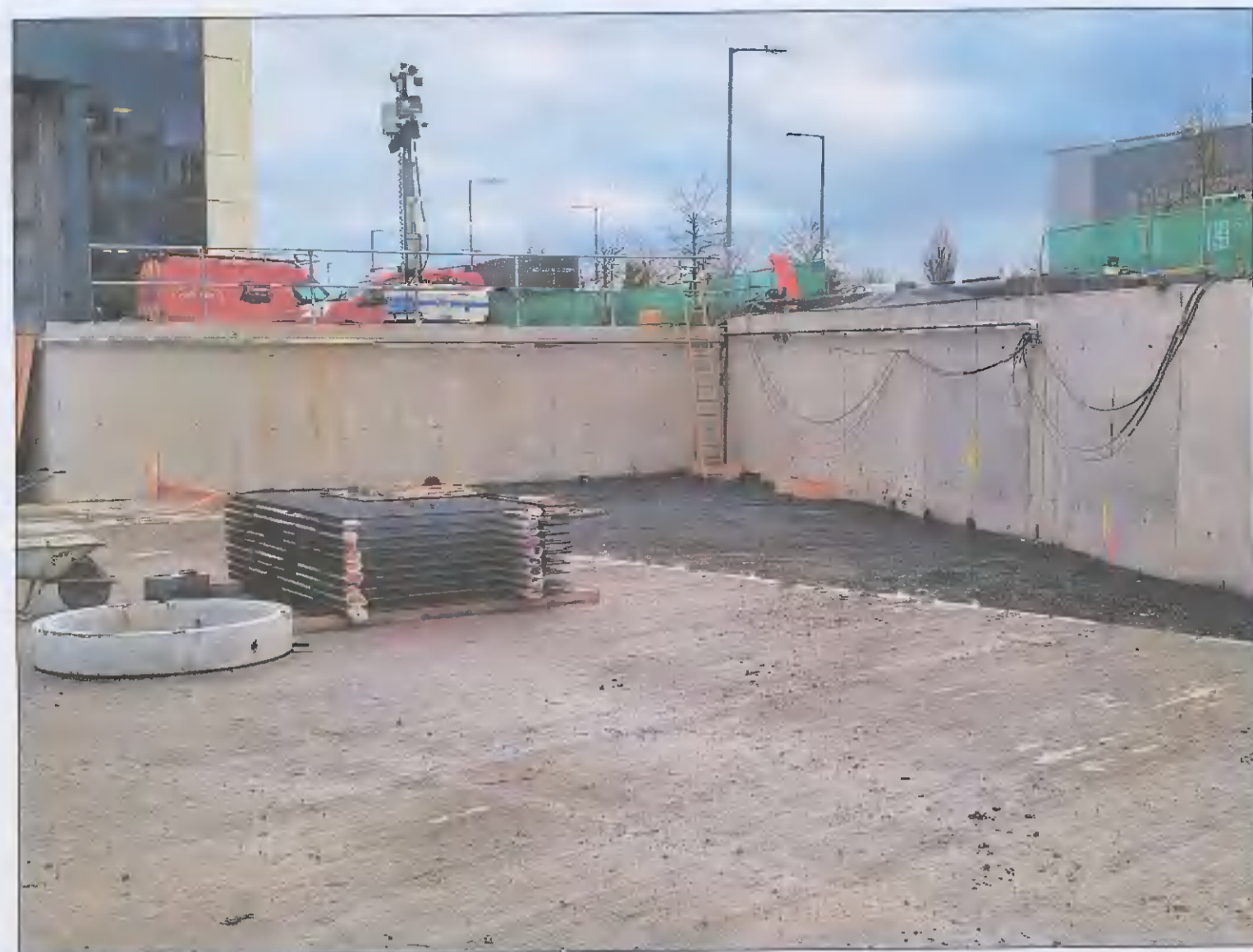
PICTURE 1: GENERATOR AND GAS TANK LOCATION AT DEVELOPMENT (AT THE CORNER)