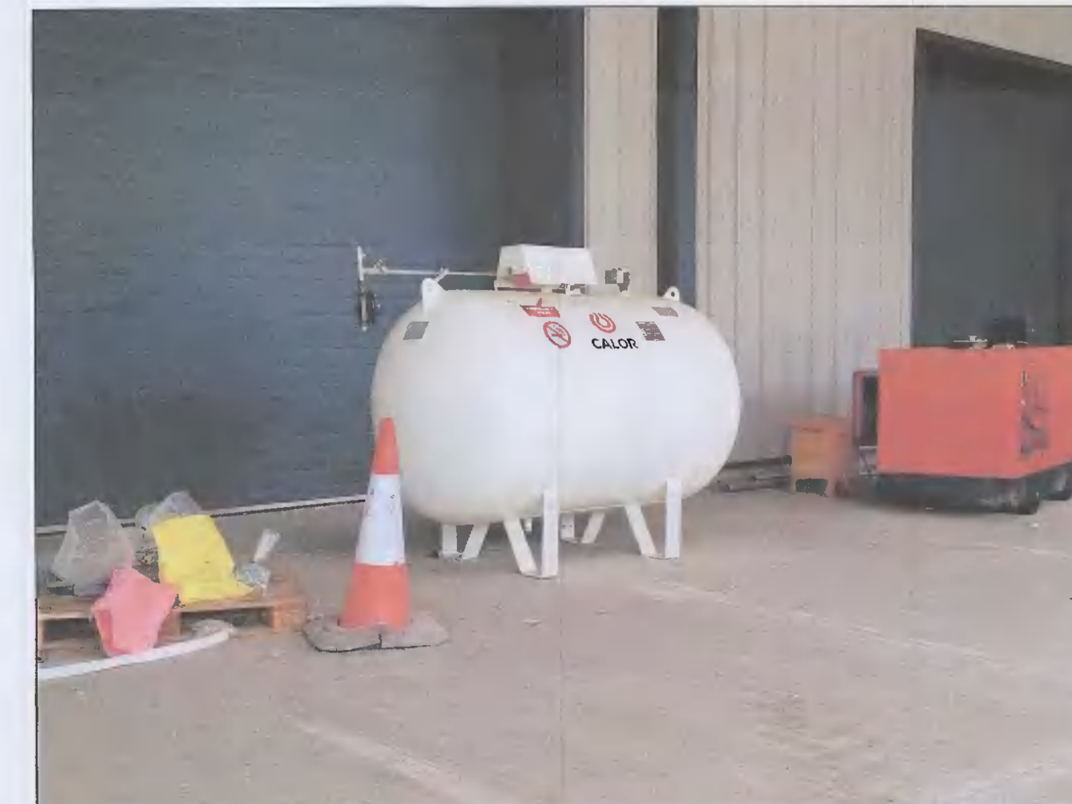
PICTURE 3: GAS TANK (AS DELIVERED ON SITE - TO BE PLACED AT THE SHOWN LOCATION)