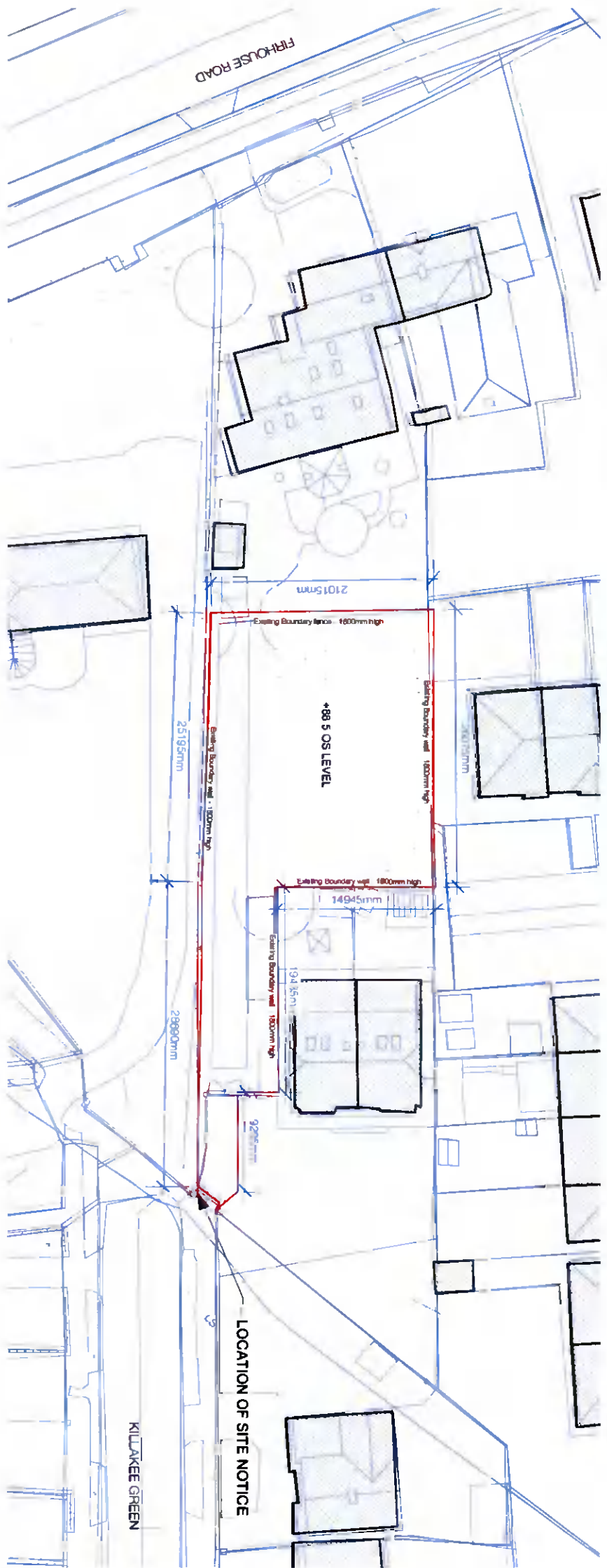
Existing Site Layout