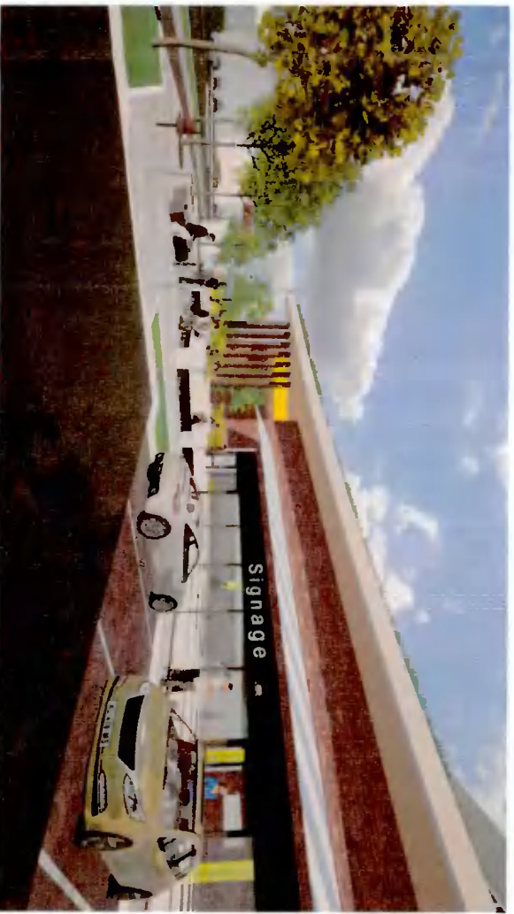
View of Coffee Shop