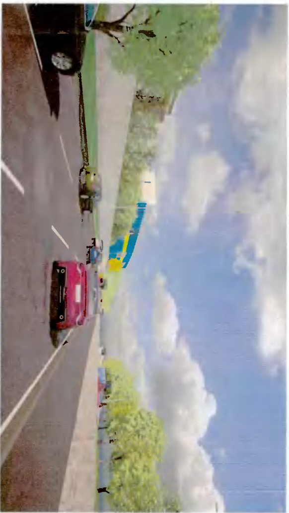
N4 Facing West