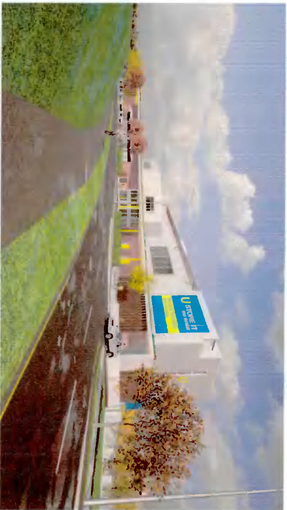
View from South-East