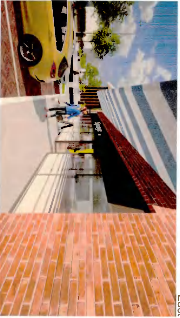
View of Coffee Shop 2