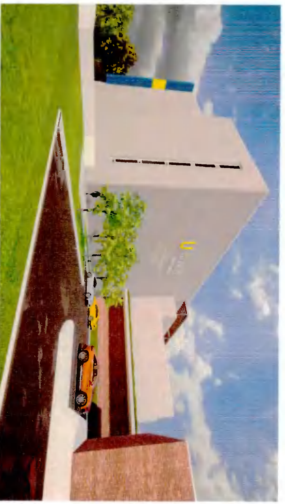
View Facing North-East