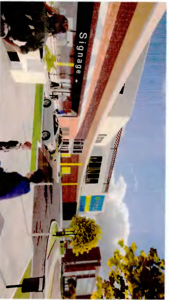
View Facing North-East