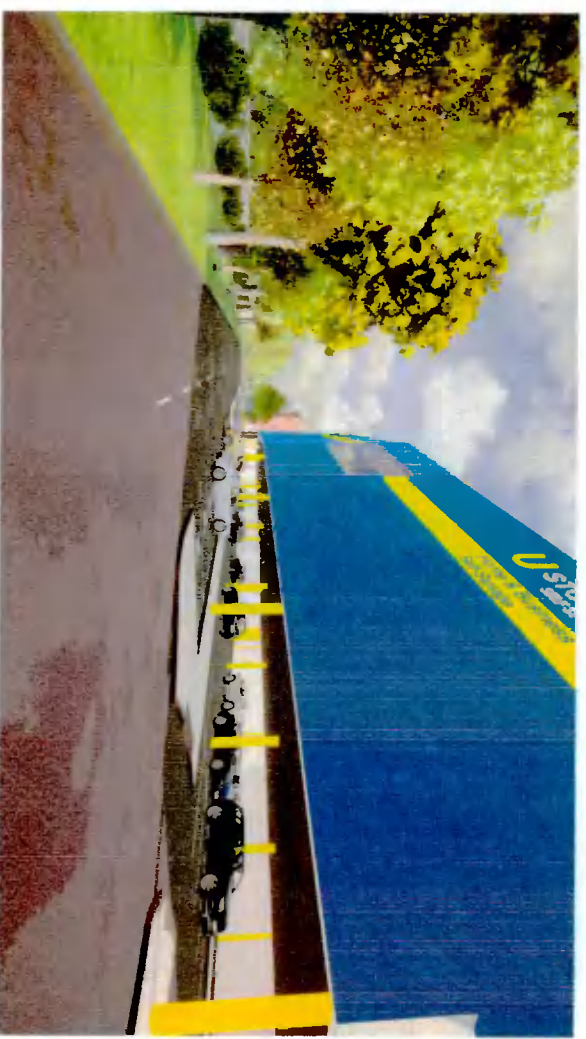
Basement Car Park Facing East