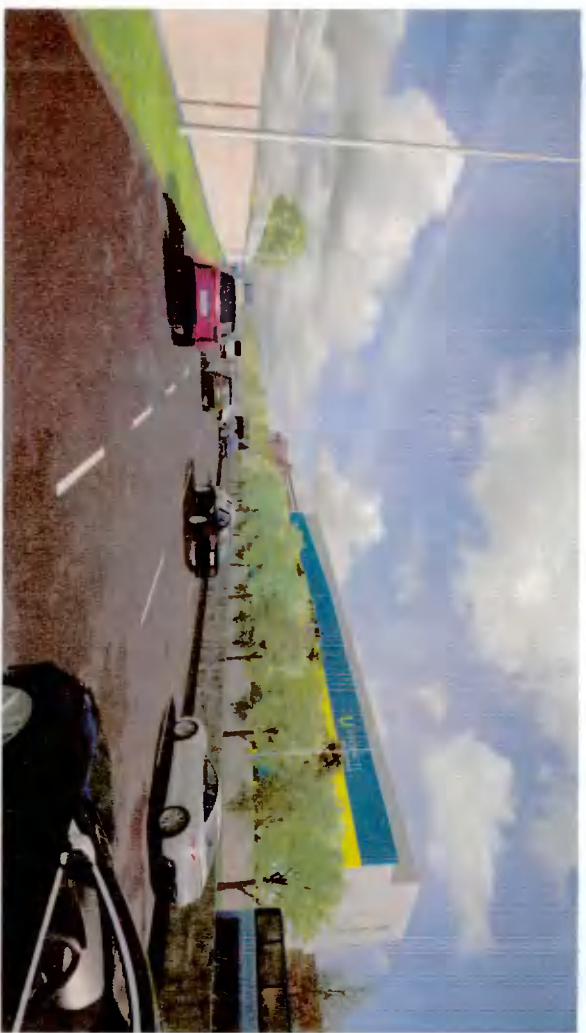
N4 Facing East