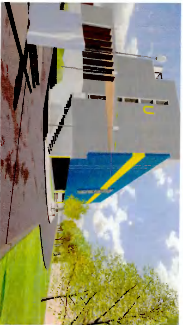
Basement Car Park Facing West