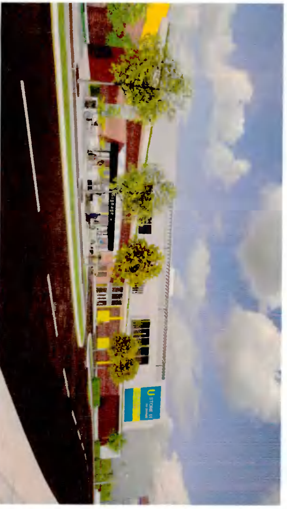
View Facing North