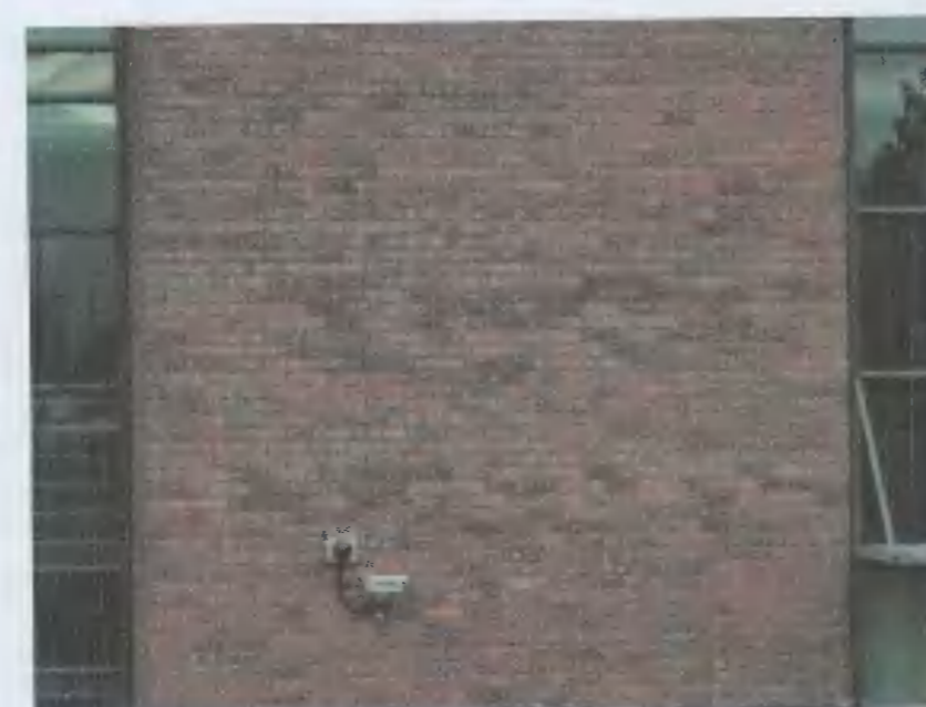
Example of proposed brick from existing Johnson & Johnson building.

For drainage layouts and details refer to drawings/report by GDCL.