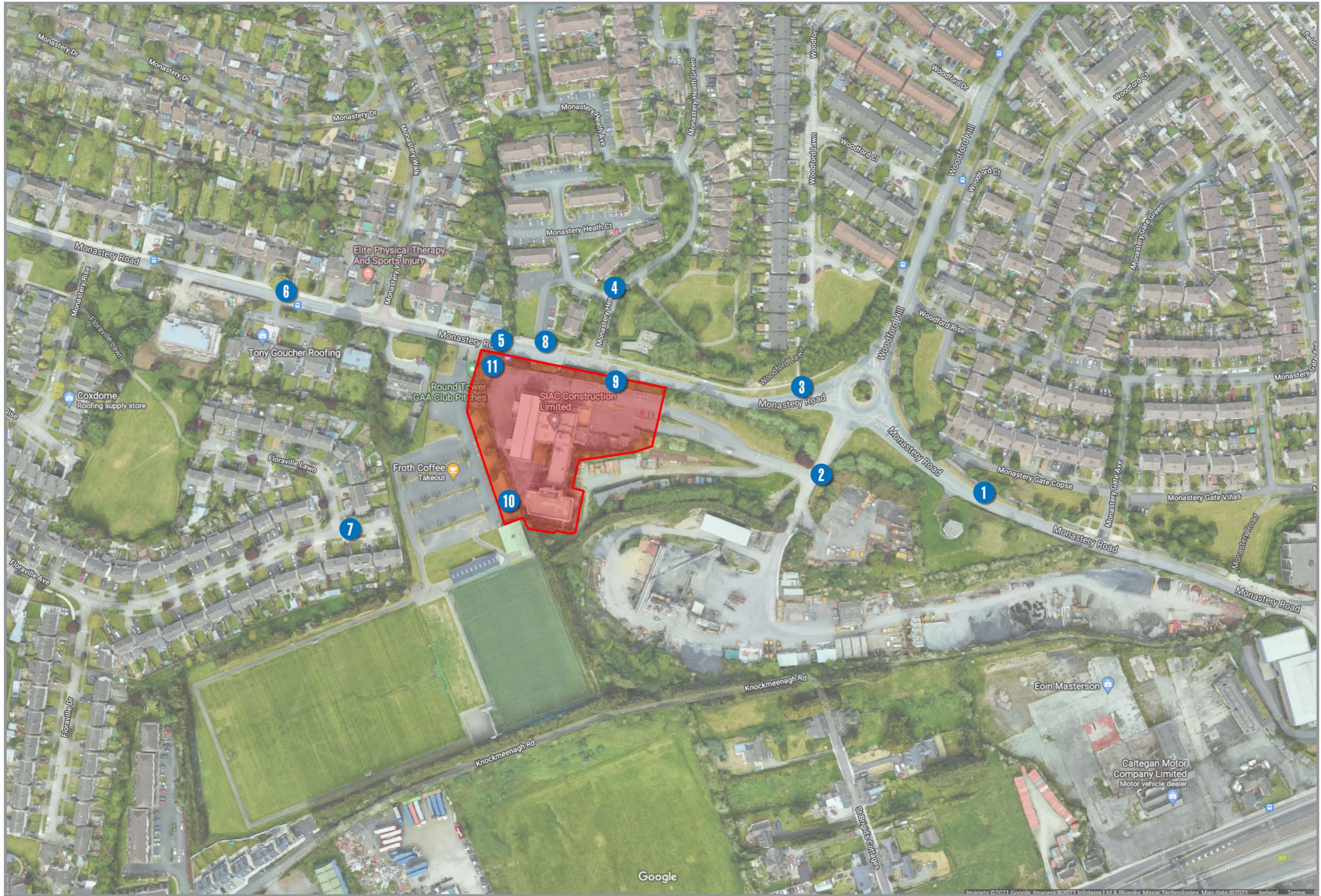
View Location Map

This map is for view location purposes only. Please refer to Architects drawings for site layout and redline boundary.