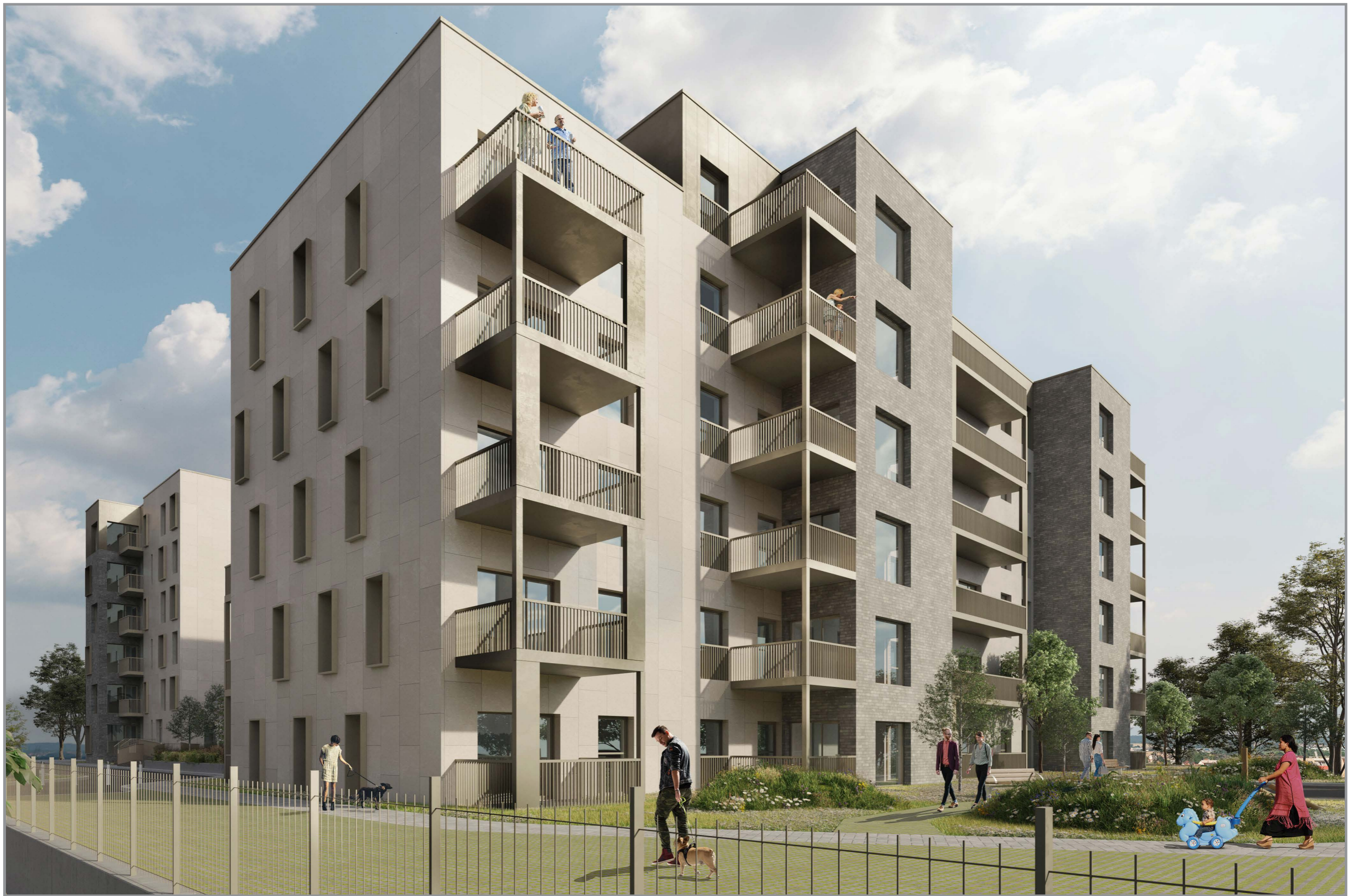
Location View 11 CGI