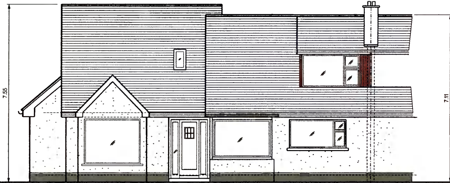
PROPOSED FRONT ELEVATION (NO CHANGE)