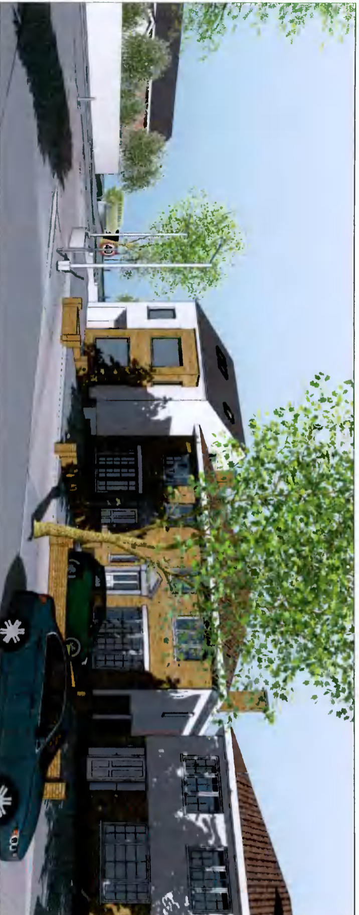
View of proposed house from Beverly Drive