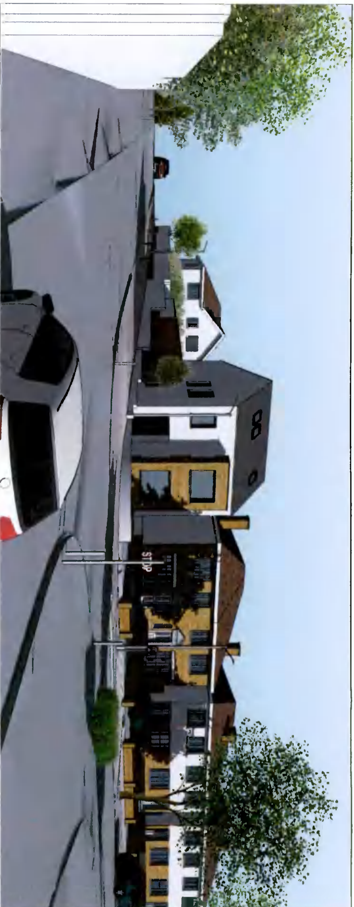
View of proposed house from Scholarstown Rd