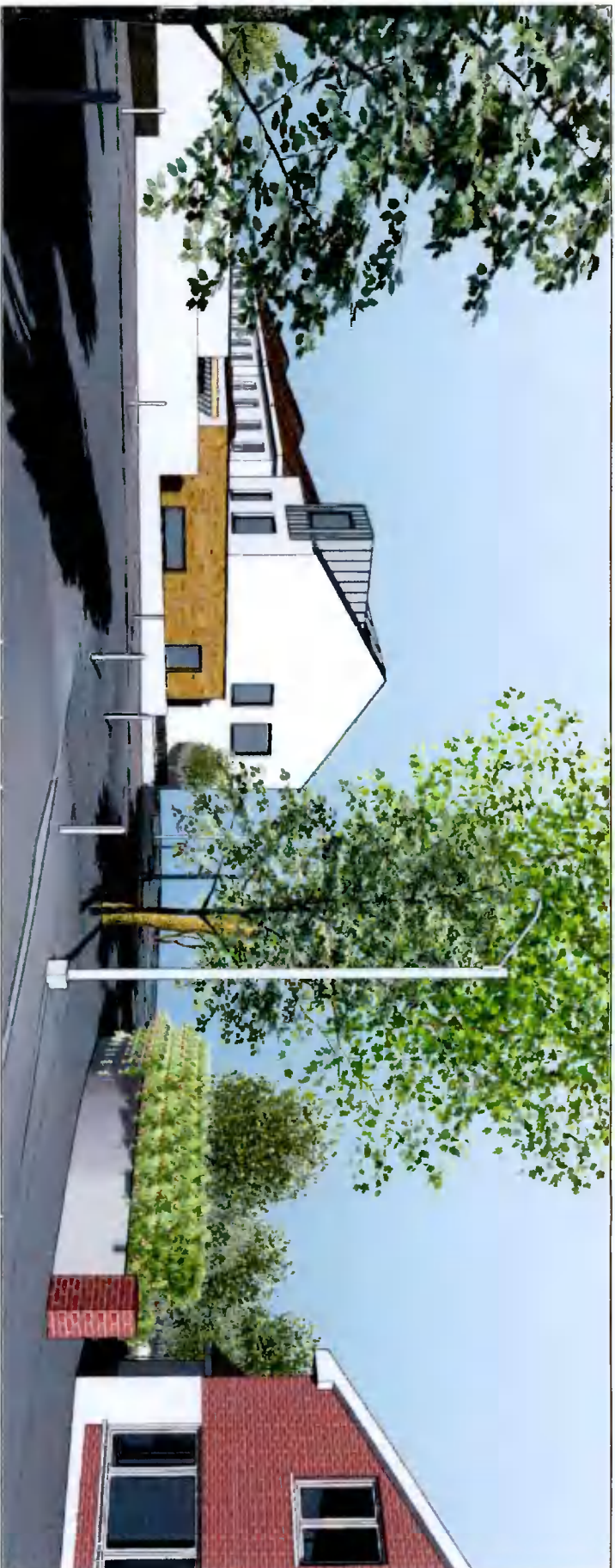
View of proposed house from The Rookery