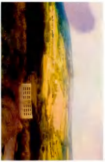
P2 IMAGE ( EXISTING GATE ENTRANCE TO SITE )

EXISTING SEPTIC TANK TO BE SUCKED OUT AND DECOMMISSIONED BY AN EPA LICENCED CONTRACTOR