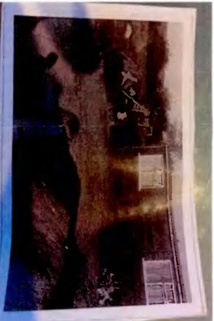
P1 IMAGE ( ORIGINAL SITE DWELLING + GRAVELLED AREA )