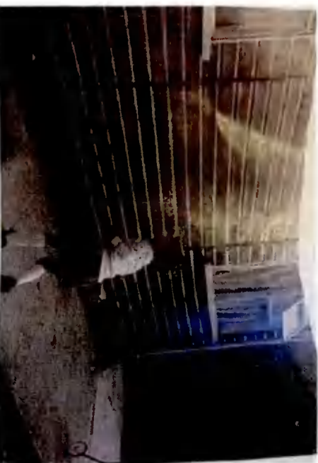
P3 IMAGE ( WEST CORNER OF ORIGINAL DWELLING )