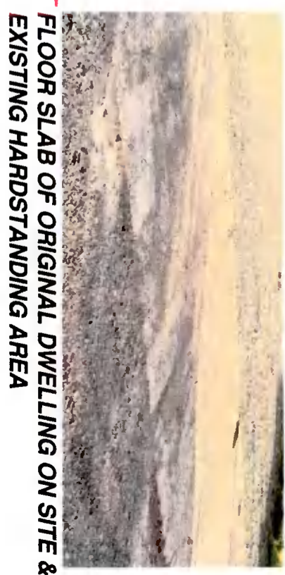
FLOOR SLAB OF ORIGINAL DWELLING ON SITE & EXISTING HARDSTANDING AREA

EXISTING SEPTIC TANK TO BE SUCKED OUT AND DECOMMISSIONED BY AN EPA LICENCED CONTRACTOR