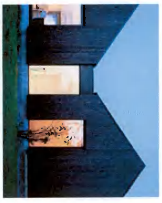
IMAGE OF BURNT LARCH WALL COVERING WE INTEND TO USE