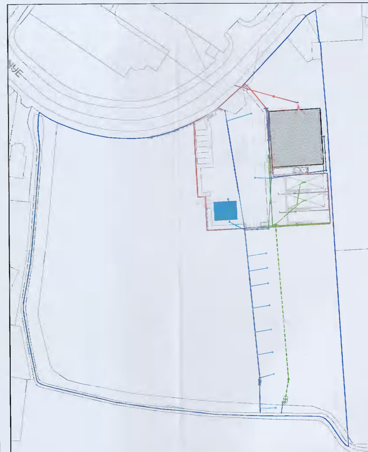
KEY PLAN SCALE 1:1000

NOTES: THIS DRAWING IN WHOLE OR IN PART SHALL NOT BE COPIED WITHOUT THE PRIOR PERMISSION OF McARDLE DOYLE LTD. ALL WORKS TO COMPLY WITH THE CURRENT BUILDING REGULATIONS. DO NOT SCALE. ORDNANCE SURVEY IRELAND LICENCE No. AR 0105719 © ORDNANCE SURVEY IRELAND / GOVERNMENT OF IRELAND