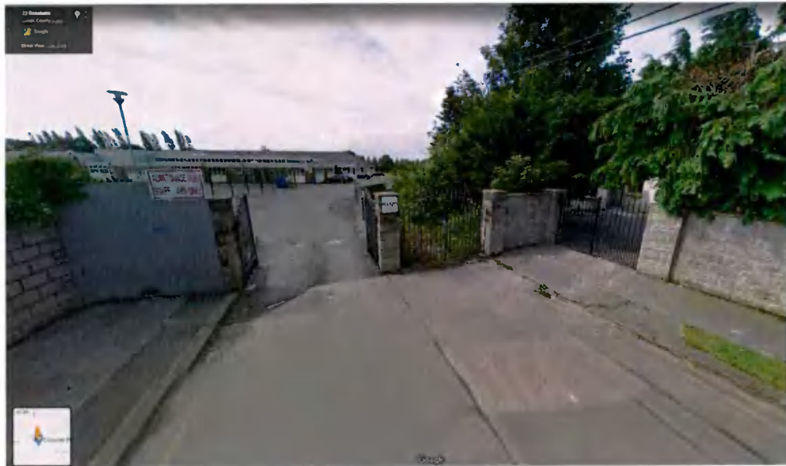
Google Street View c.2009