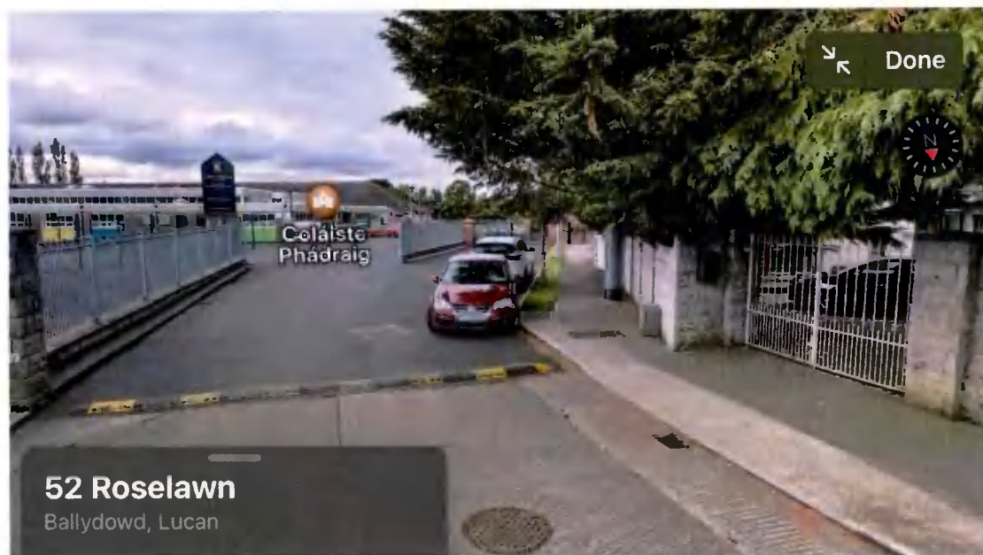
c. 2020