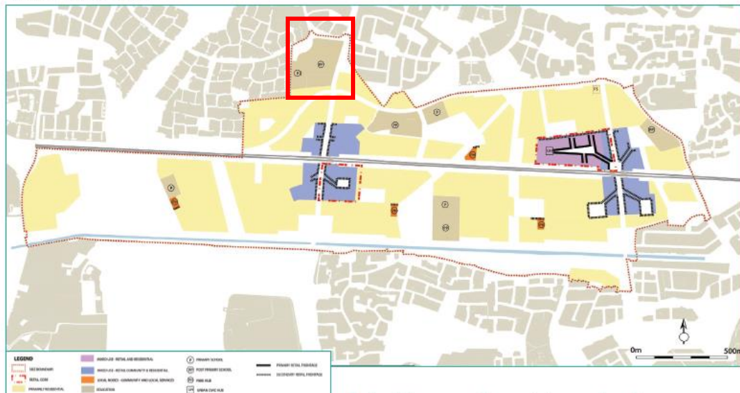
Figure 2.5.1 | Function Map for Planning Scheme

Under Table 4.3 Phasing Table of the 2019 Planning Scheme, Phase 1B (1,001 – 2,000 units) identifies the requirement for the delivery of a school site to facilitate the construction and occupation of 1,001-2,000 units. This school will be delivered in line with the land use map identified under Figure 2.5.1.