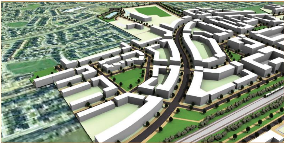
Figure 3.3.16 | 3D Image Kishoge North West

The intention of the Planning Scheme for the school site is outlined in the CGI contained within the Planning Scheme (Figure 3.3.16) shown below. This identifies a large playing pitch area as part of this larger Post Primary school site.