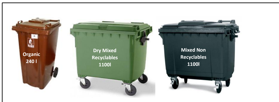
Figure 5.1 Typical waste receptacles of varying size (240L and 1100L)