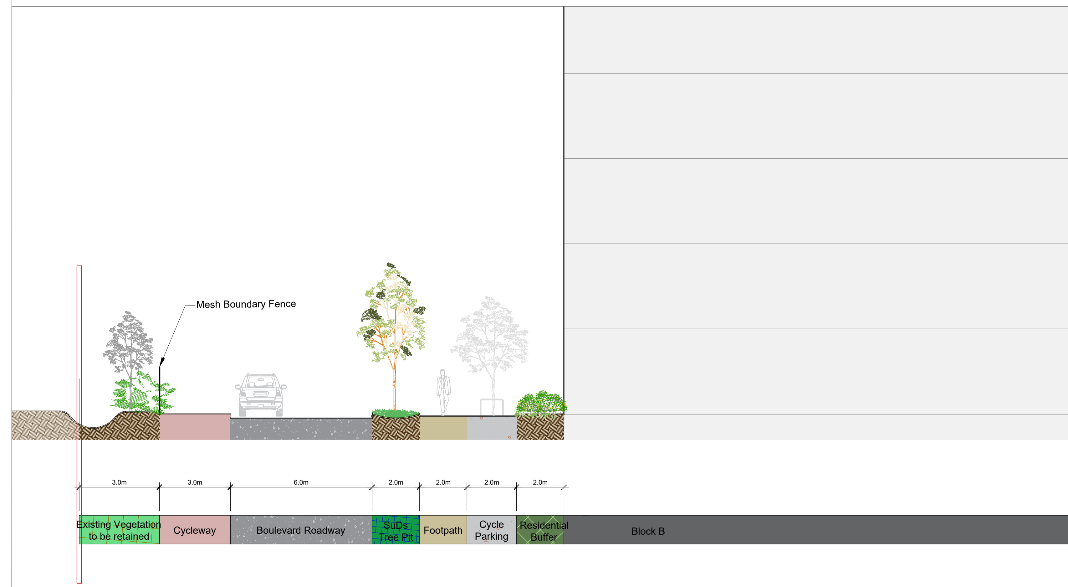
Section C-C' (1:100)