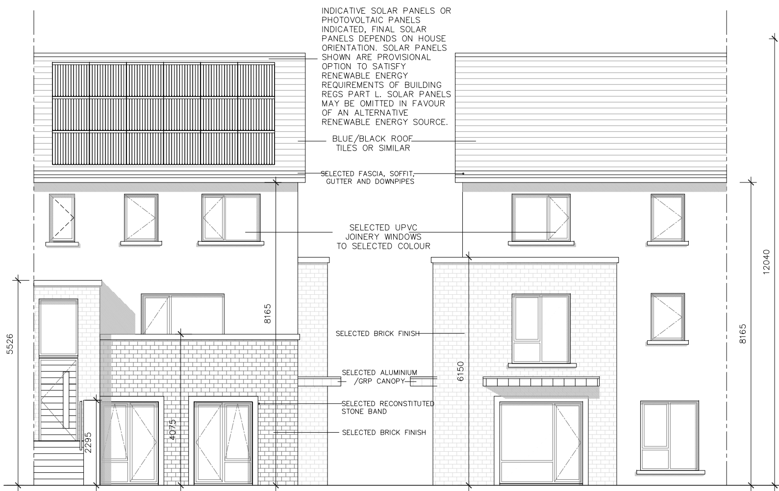
02 Rear Elevation PA-D-301 1:100