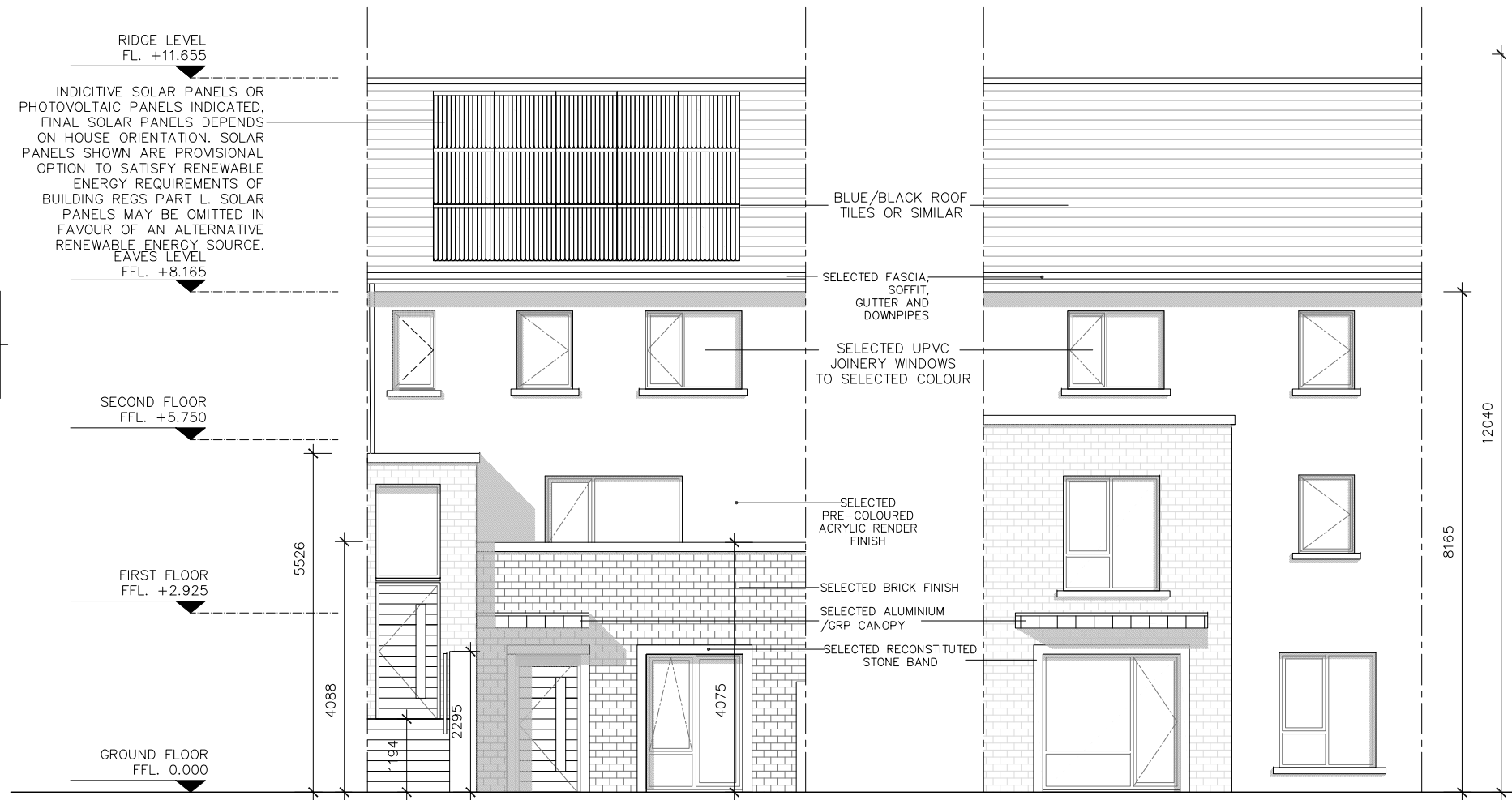
01 Front Elevation PA-D-300 1:100