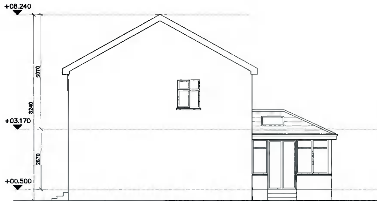
Existing Side Elevation Scale - 1:100