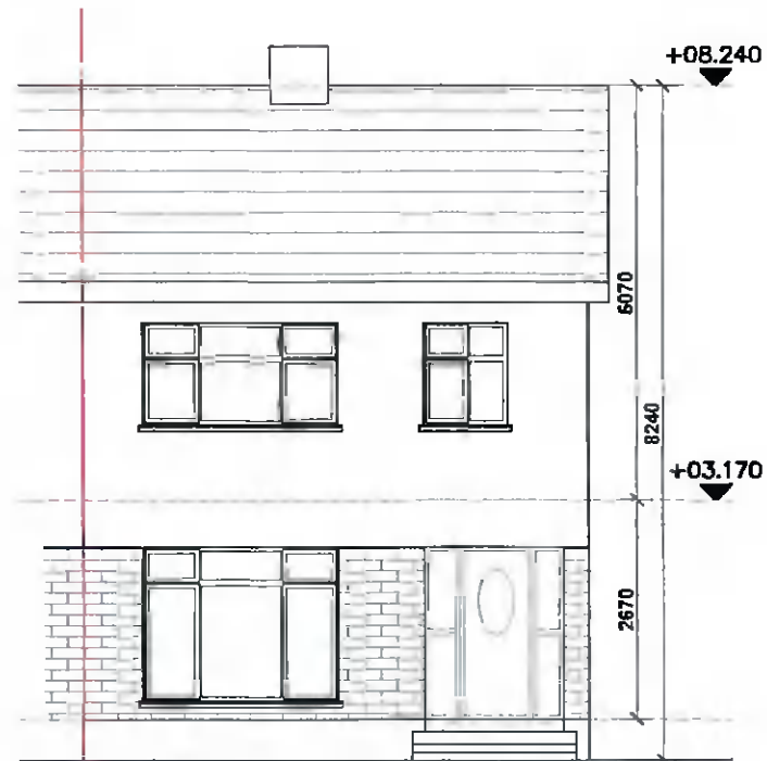
Existing Front Elevation Scale - 1:100