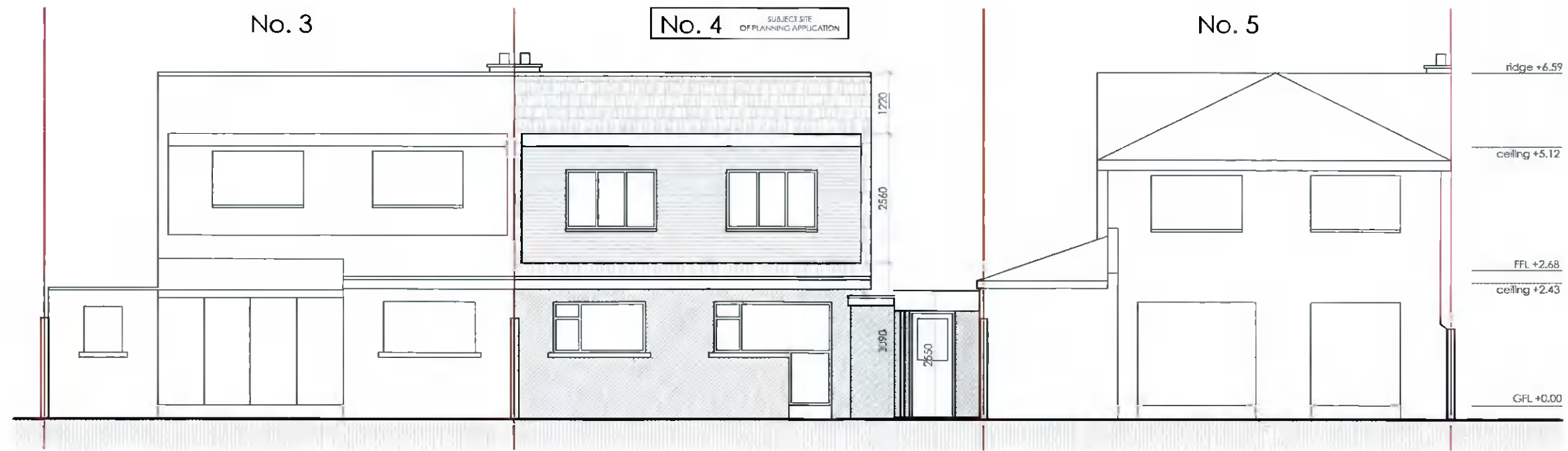
EXISTING REAR ELEVATION (N) scale 1:100 @ A3

Client Andrew Weddick 4 Old Orchard Ann Devlin Road Rathfarnham Dublin 14, D14 Y611