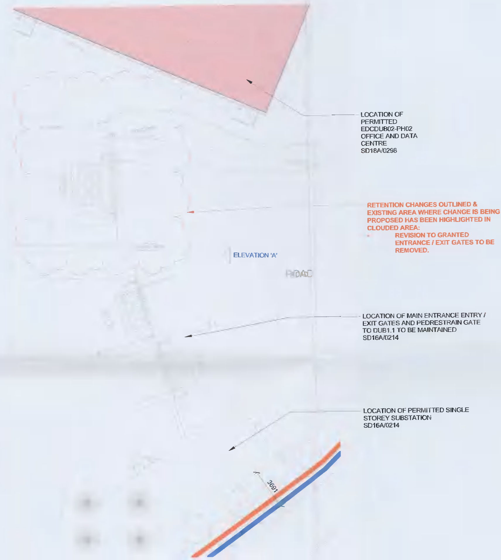
1 PERMITTED ENTRANCE GATE 'A' LAYOUT PLAN 01 SCALE: 1 : 200