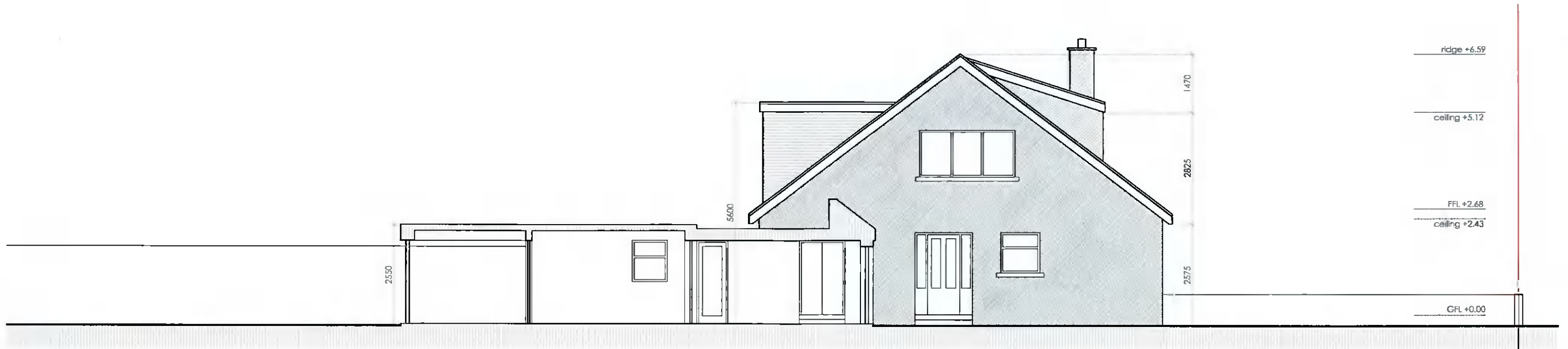
EXISTING SIDE ELEVATION (W) scale 1:100 @ A3

Client Andrew Weddick 4 Old Orchard Ann Devlin Road Rathfarnham Dublin 14, D14 Y611