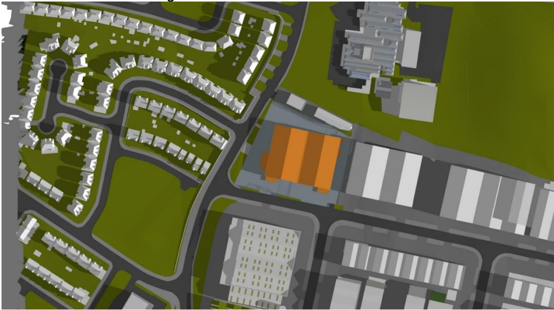
09.00 March 21 st – existing