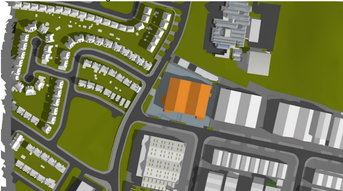
10.00 March 21 st – existing