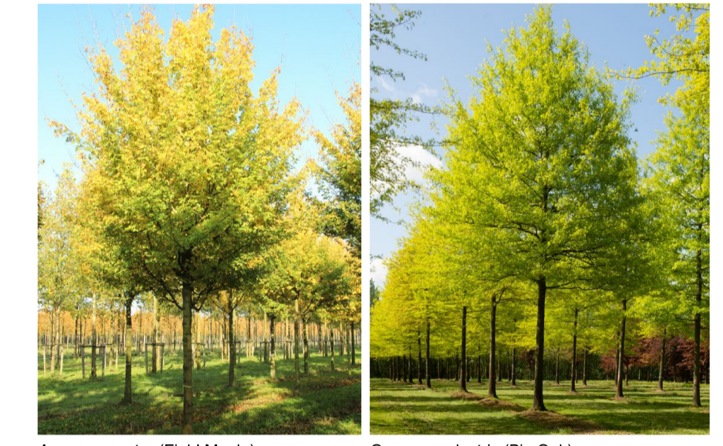
Acer campestre (Field Maple) Quercus palustris (Pin Oak)