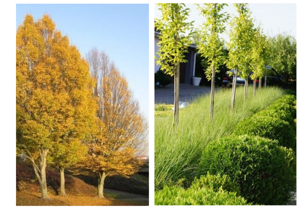
Carpinus betulus (Hornbeam) Betula pendula with under storey of grasses