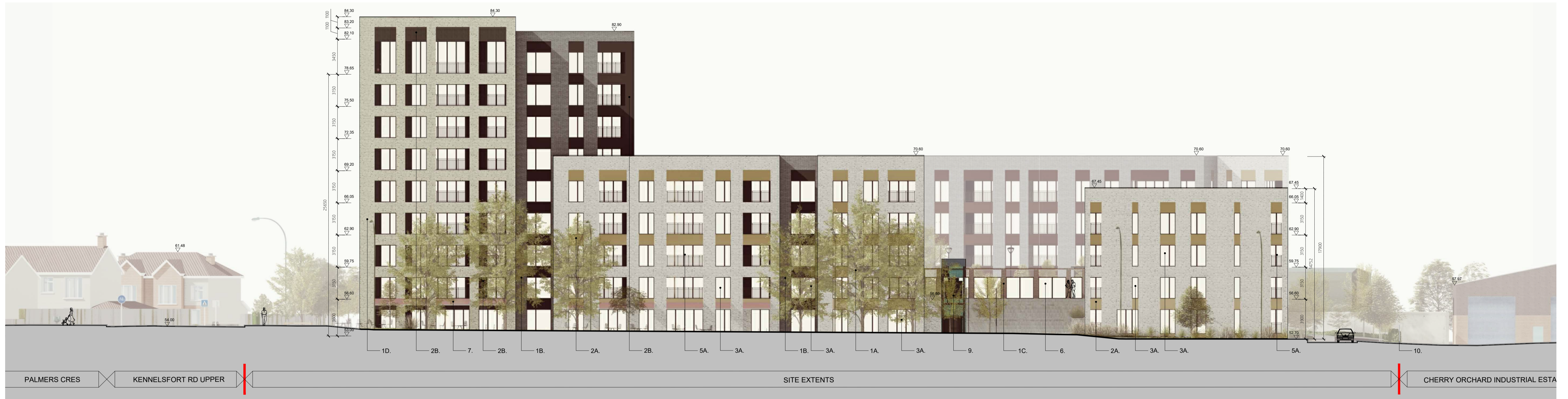
1 SOUTH ELEVATION SCALE 1:200