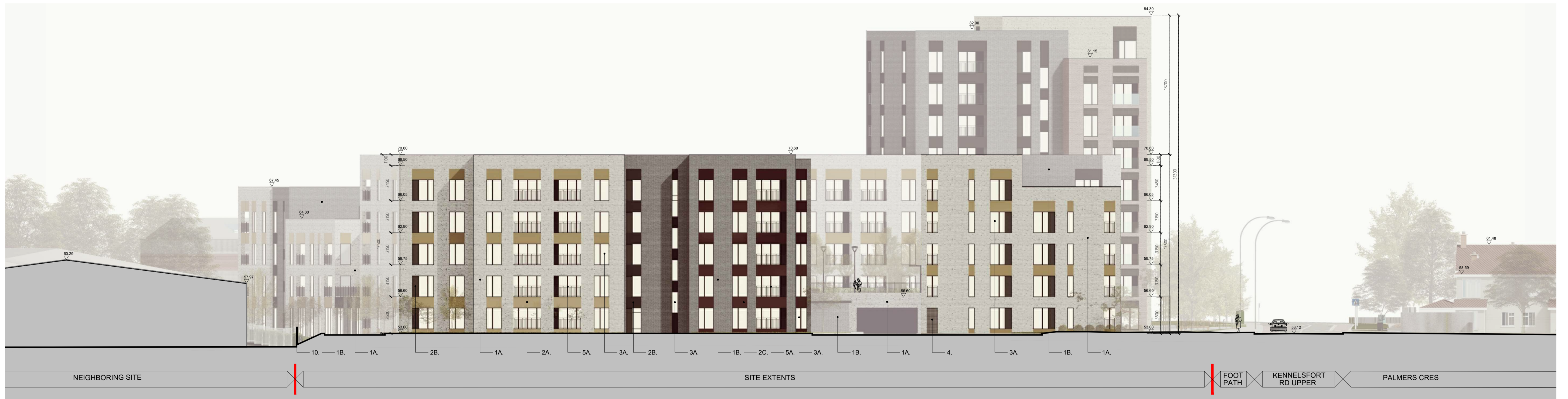
2 NORTH ELEVATION SCALE 1:200