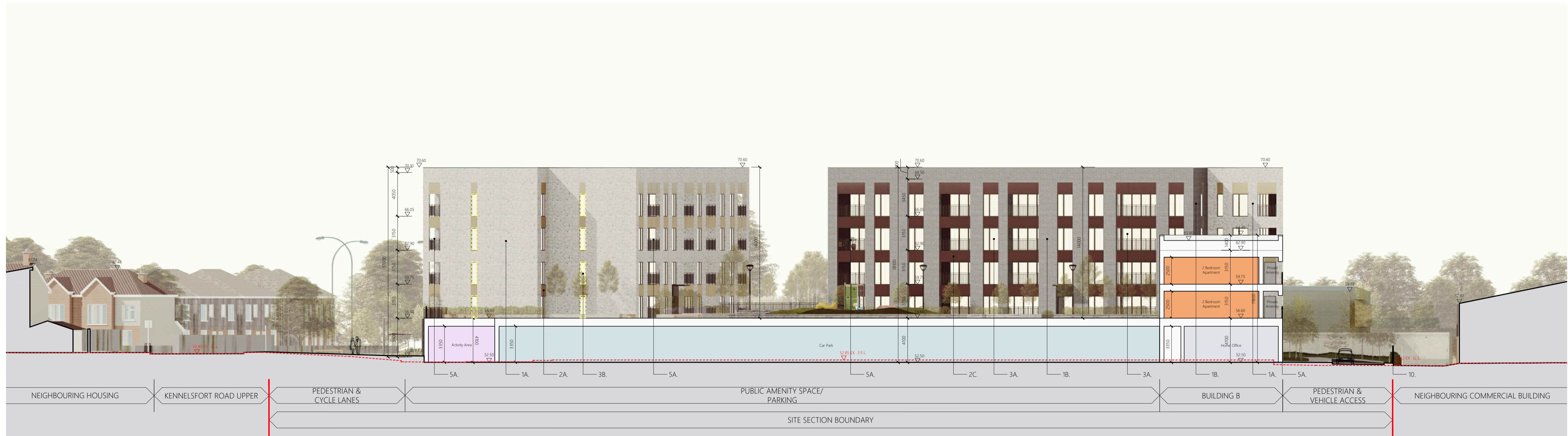
1 SECTION D1:D1 SCALE 1:200