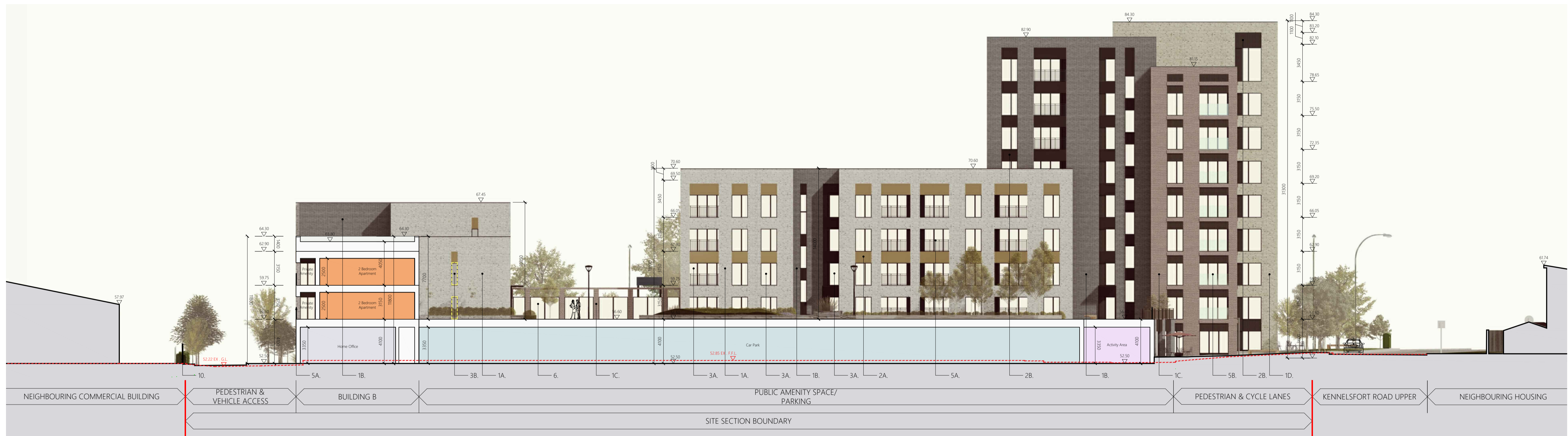
2 SECTION D2:D2 SCALE 1:200