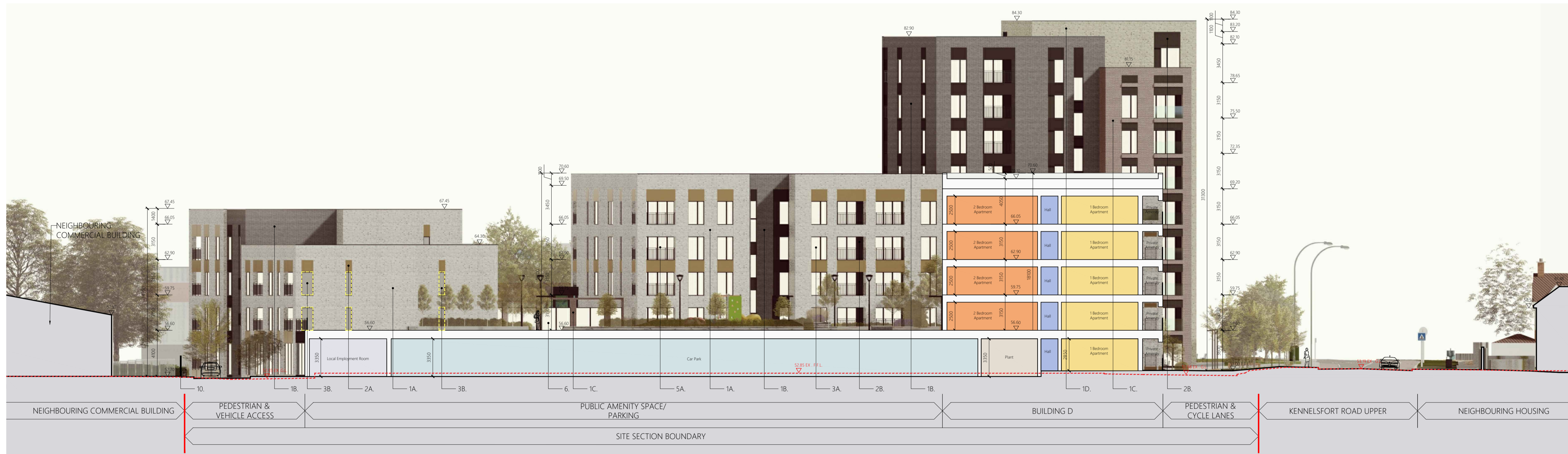
2 SECTION C:C SCALE 1:200