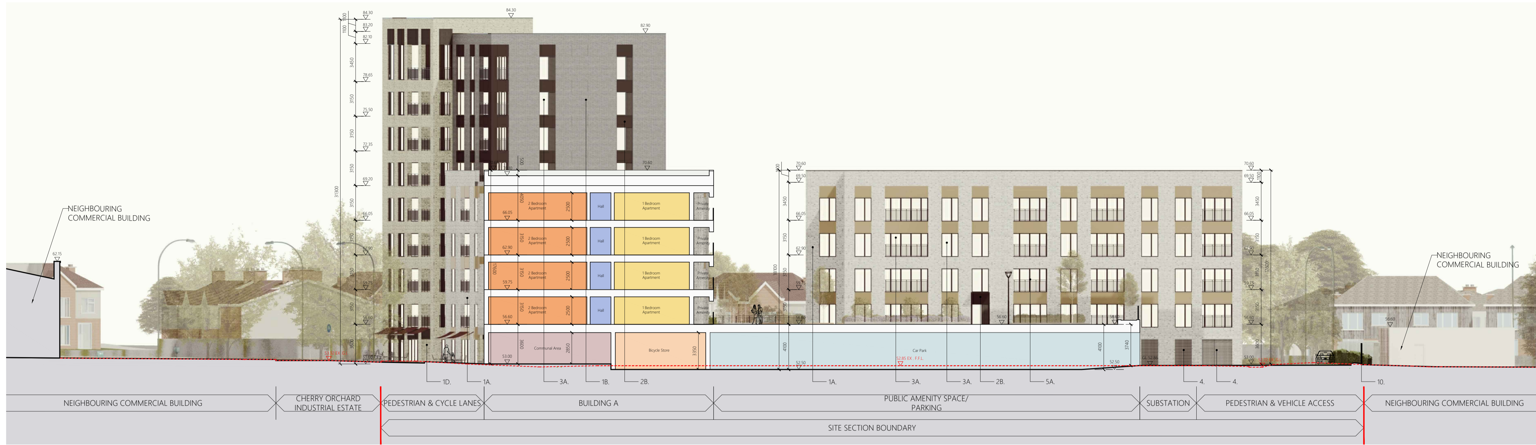
1 SECTION A:A SCALE 1:200