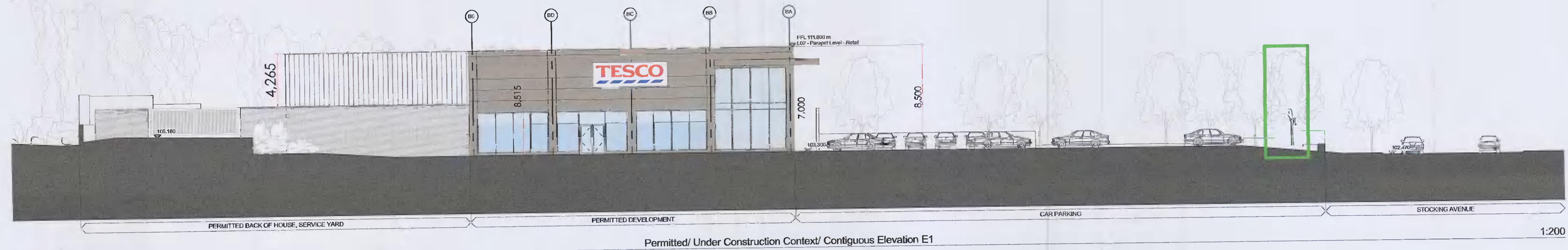
Permitted/ Under Construction Context/ Contiguous Elevation E1