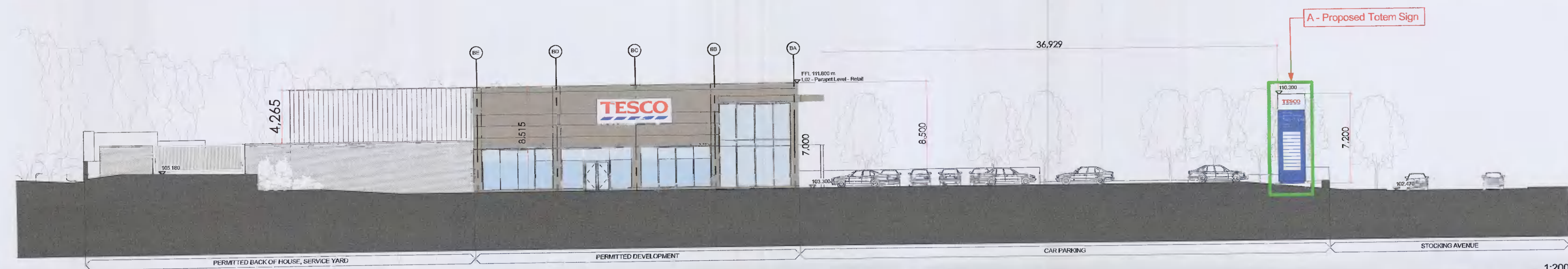
Proposed Context/ Contiguous Elevation E1