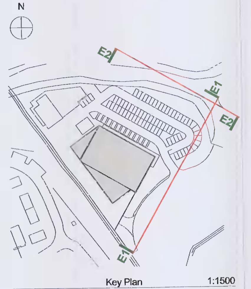
Key Plan 1:1500