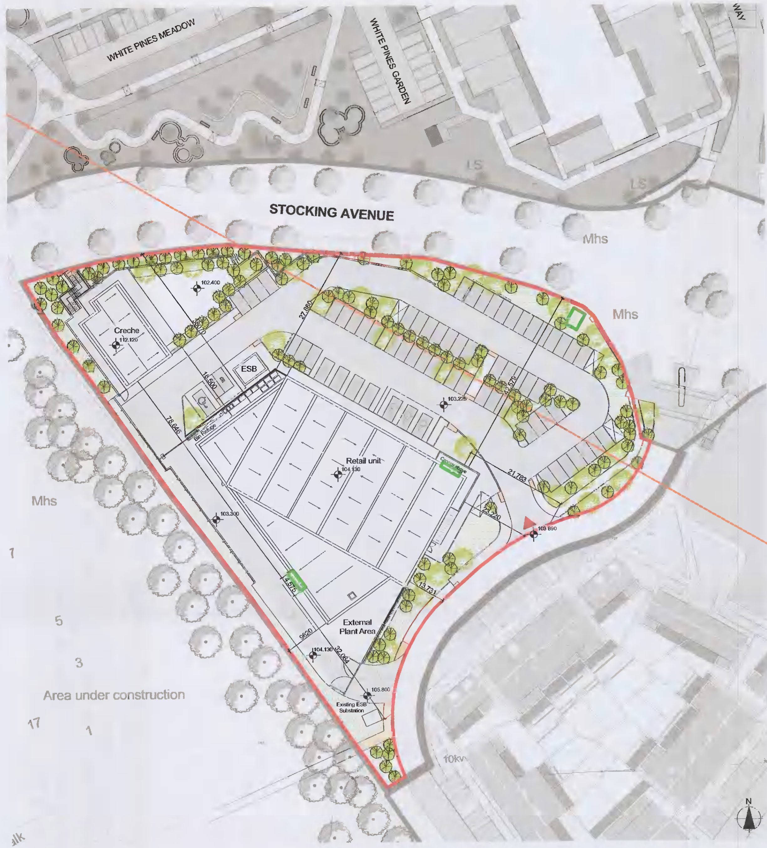
Permitted/ Under Construction Site Plan Layout