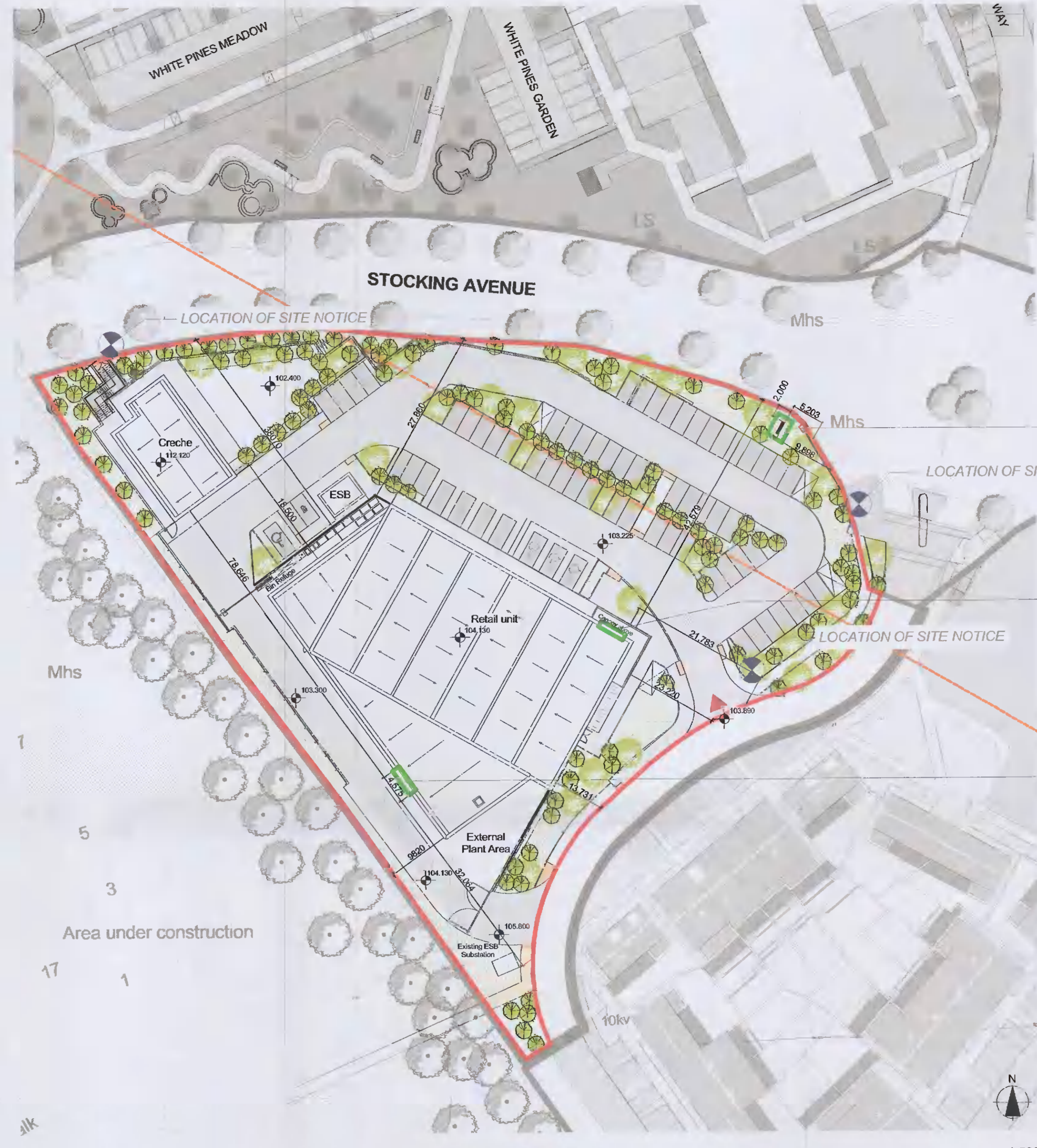
Proposed Site Plan Layout