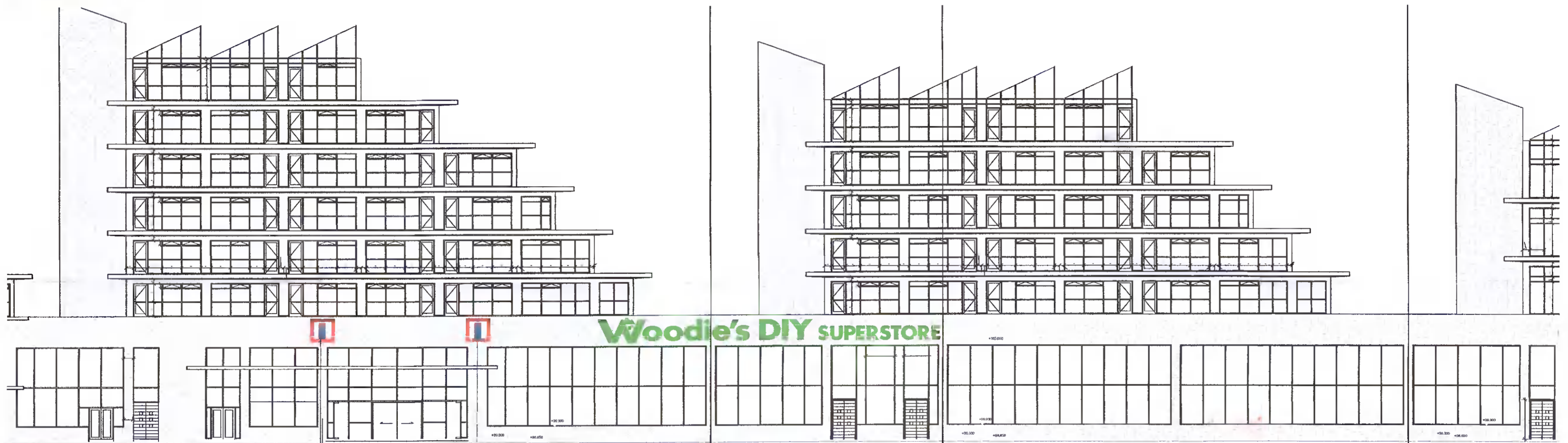
PROPOSED NORTH ELEVATION SCALE: 1:100