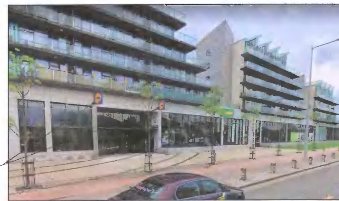
CONTEXTUAL IMAGE SHOWING PROPOSED SIGNAGE LOCATION SCALE: 1:NTS