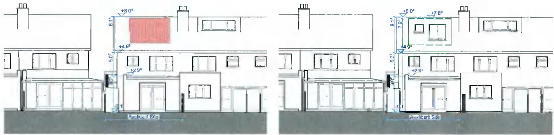
A Existing Elevation 1:200 A Proposed Elevation 1:200