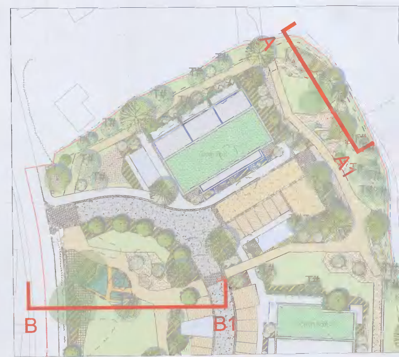
Section A PLANTERS WITH SEATING AREA AND EXISTING TREES Scale 1:100