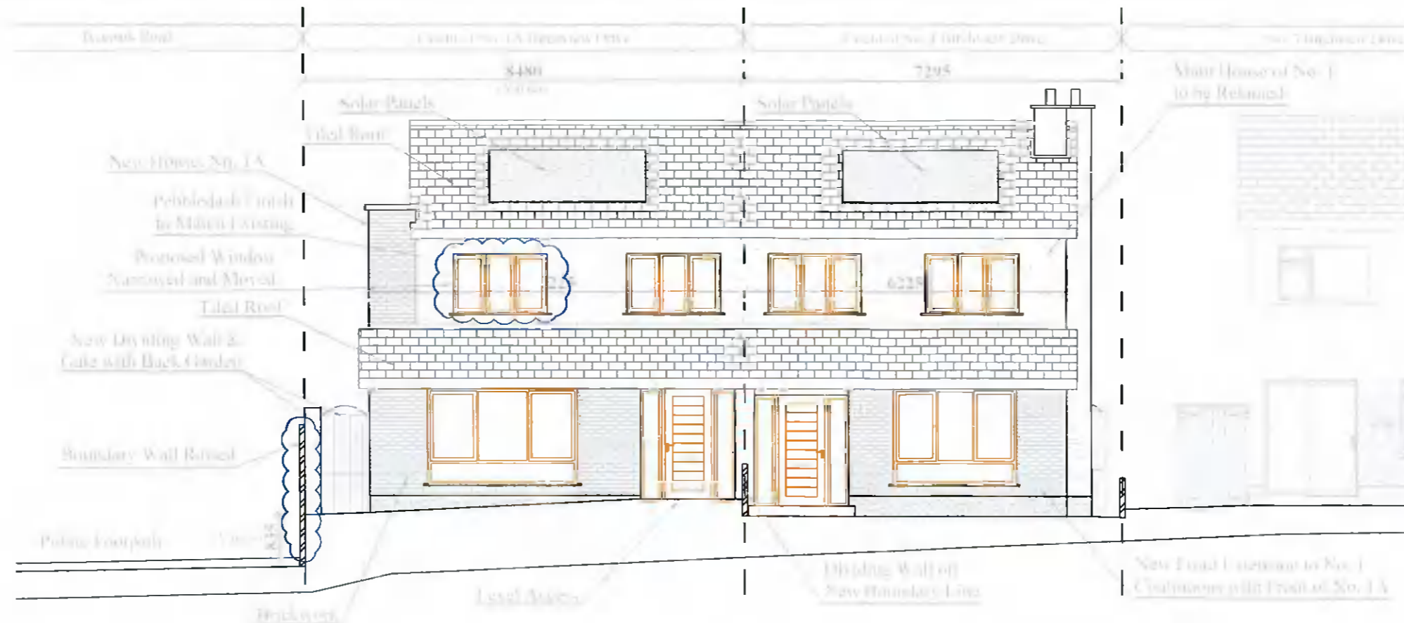
14 Proposed Southwest (Front) Elevation Scale: 1:100

COPYRIGHT No part of this document may be re-produced or transmitted in any form or stored in any retrieval system of any nature without the written permission of iStruct Consulting Engineers as copyright holder except as agreed for use on the project for which the document was originally issued