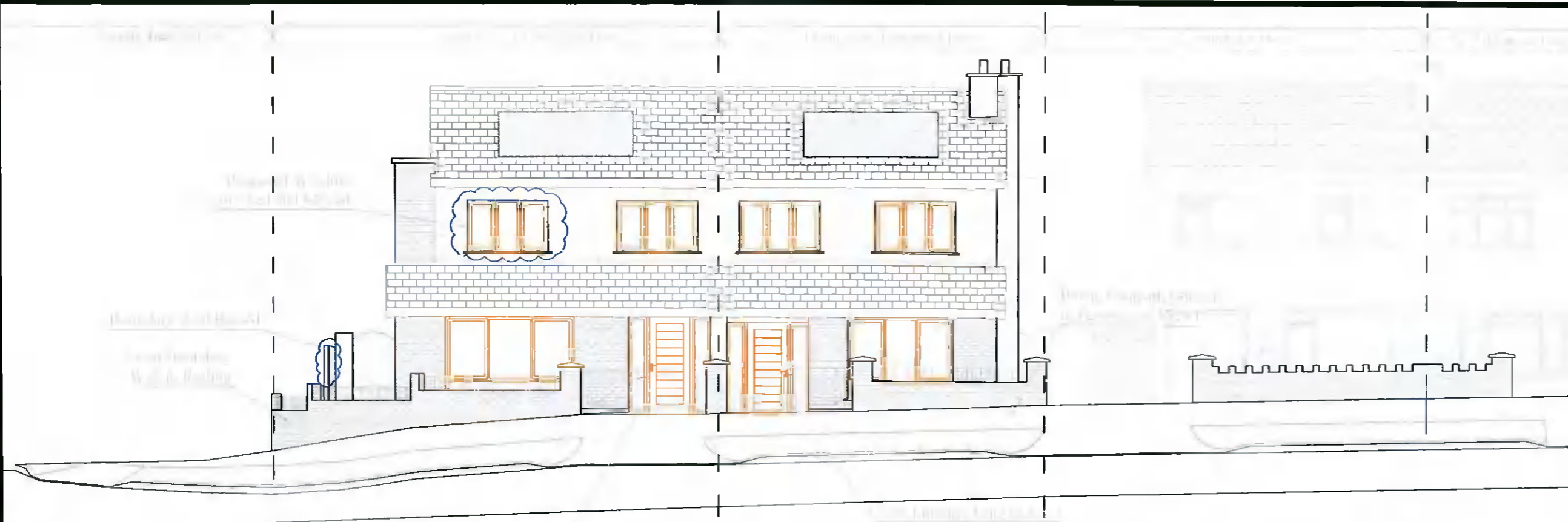
18 Proposed Southwest Contextual Elevation Scale: 1:100