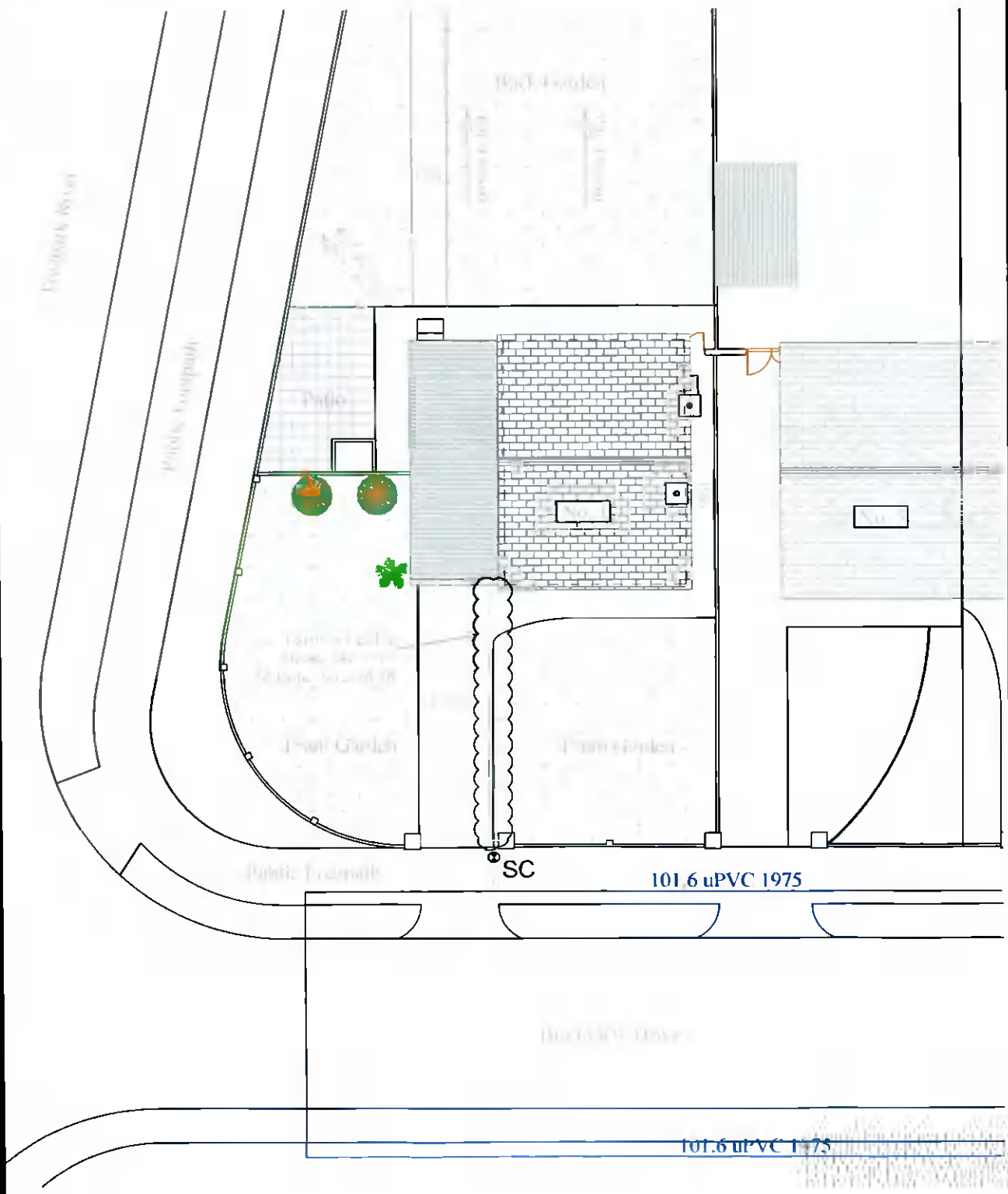
35 Existing Watermain Layout Scale: 1:200