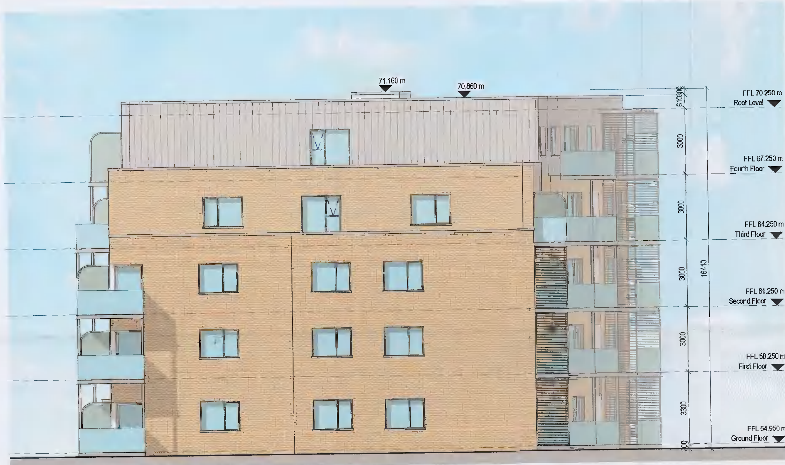
BLOCK 3 SIDE ELEVATION (EAST)