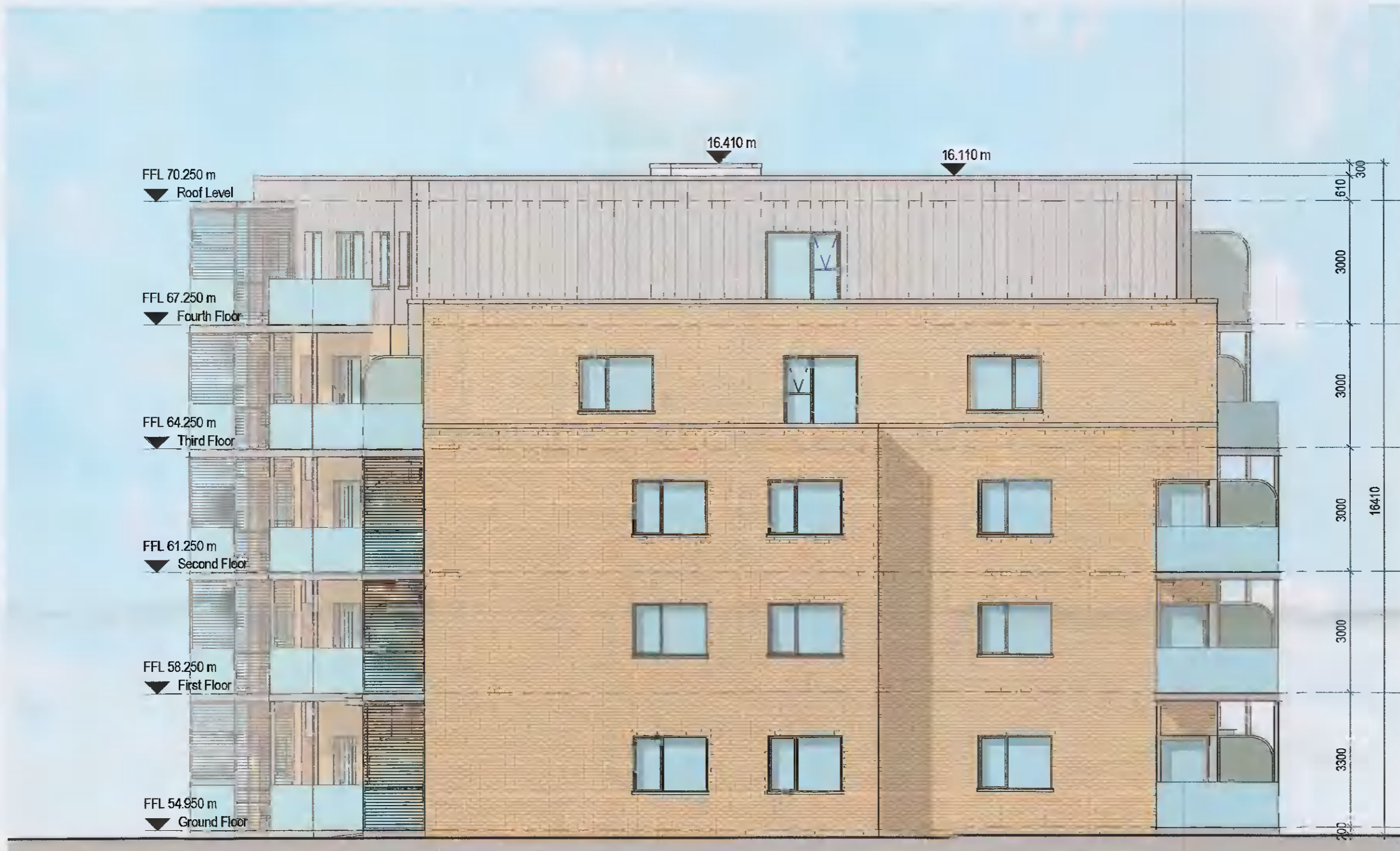
BLOCK 2 SIDE ELEVATION (WEST) 1 : 100