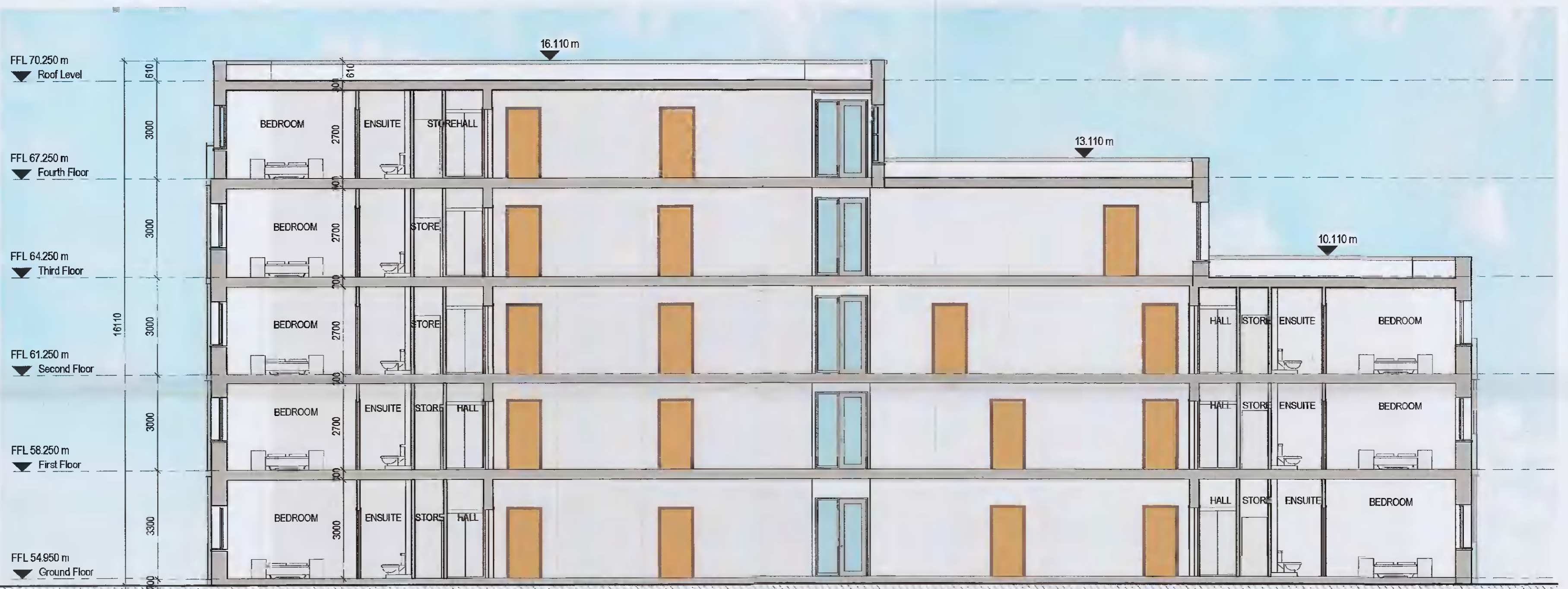
BLOCK 2 SECTION A-A 1 : 100