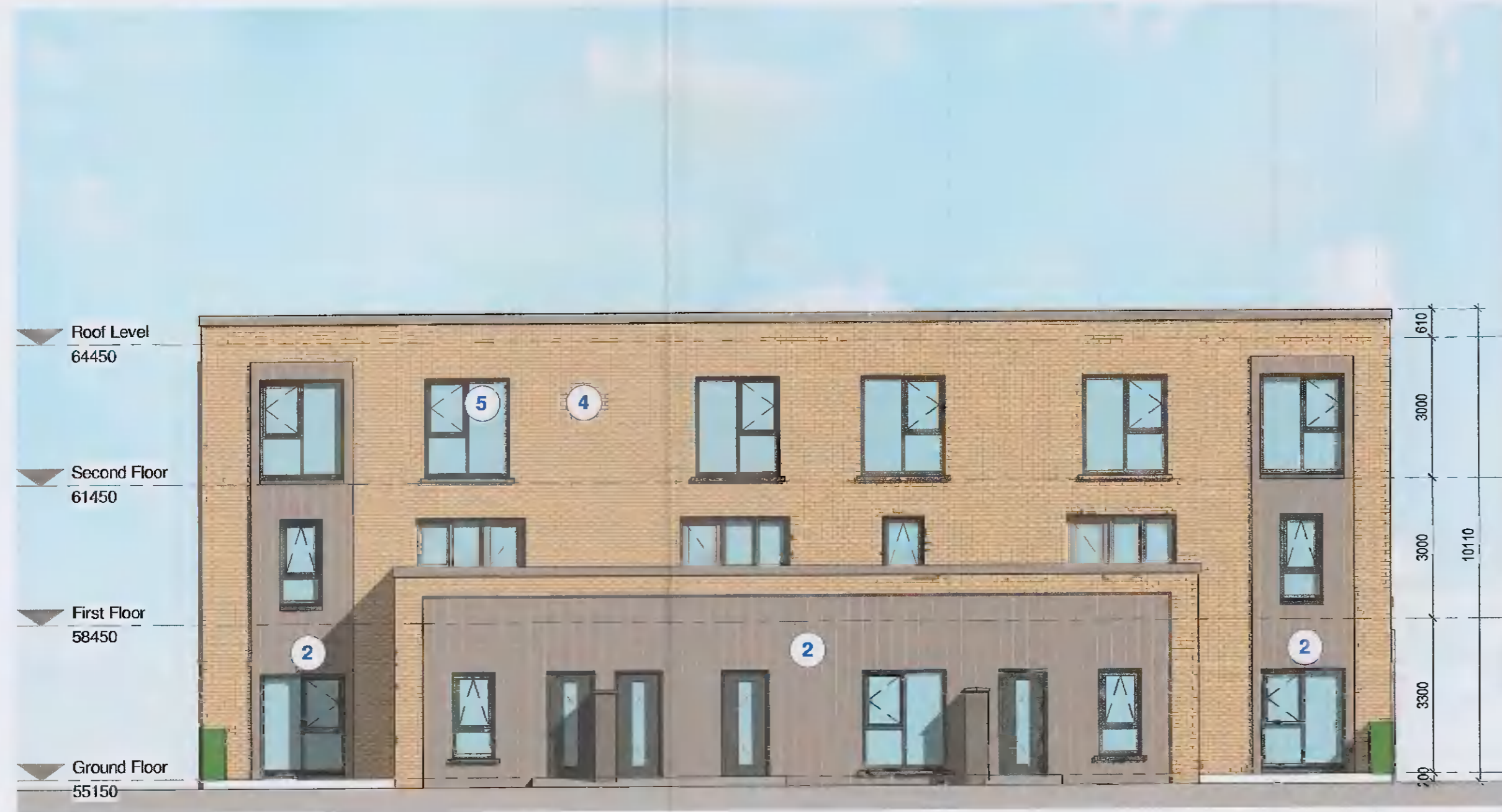
BLOCK 1 FRONT ELEVATION 1 : 100