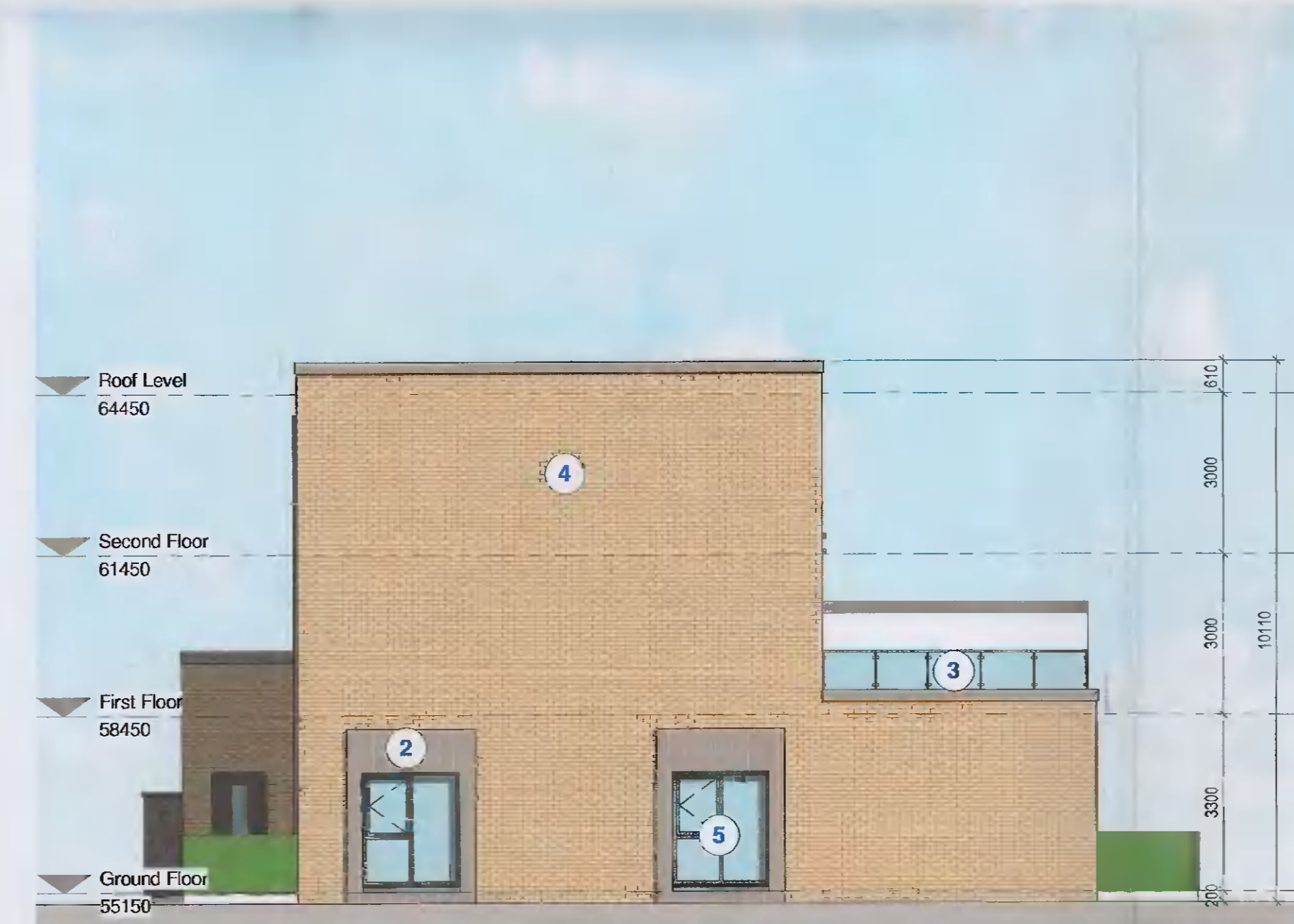
BLOCK 1 SIDE ELEVATION (WEST) 1 : 100