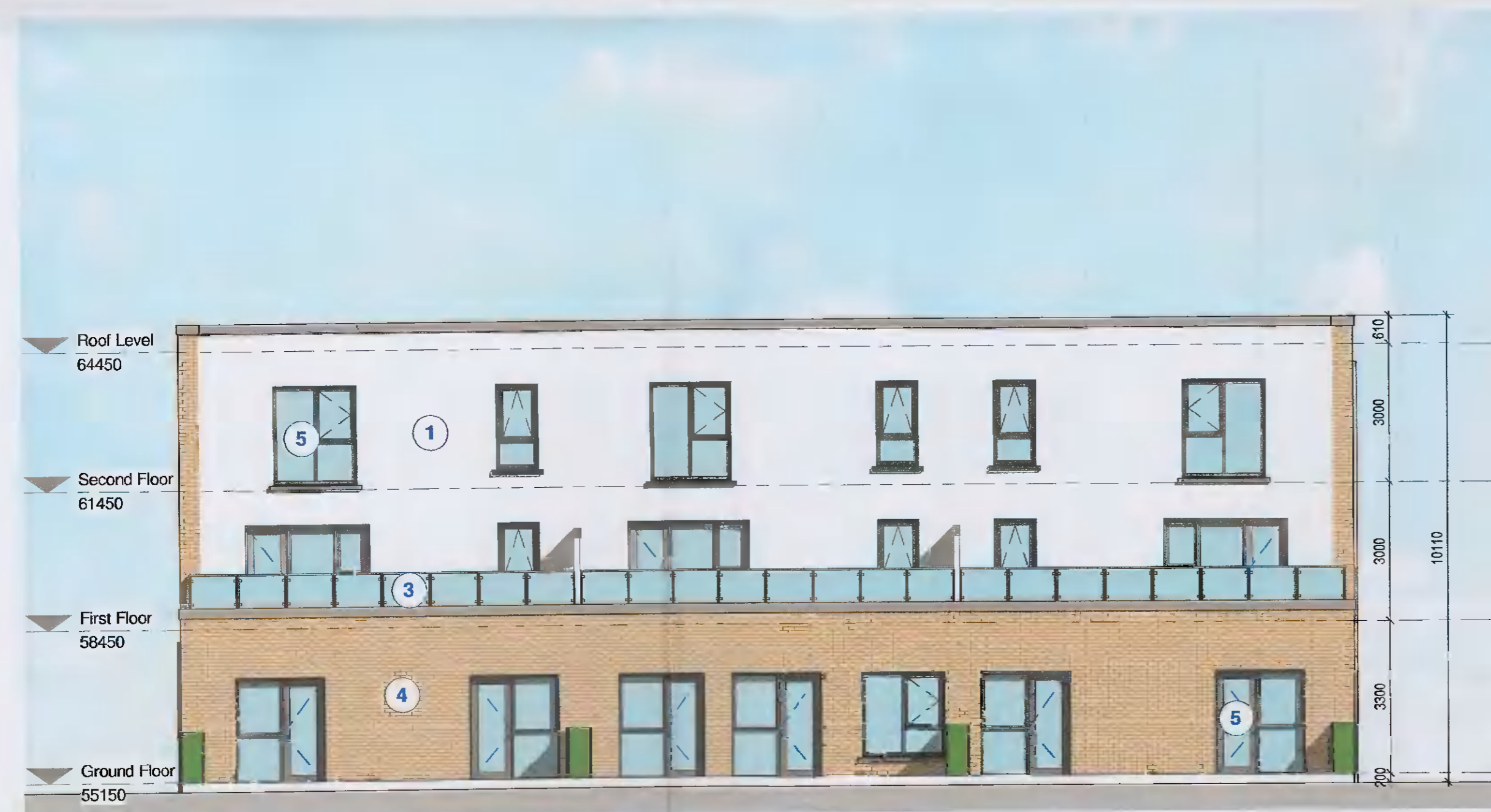
BLOCK 1 REAR ELEVATION 1 : 100