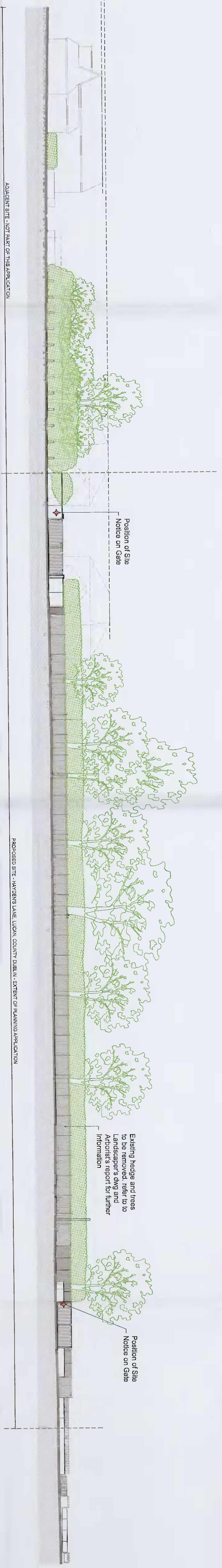
EXISTING CONTIGUOUS ELEVATION Scale 1/200@A0