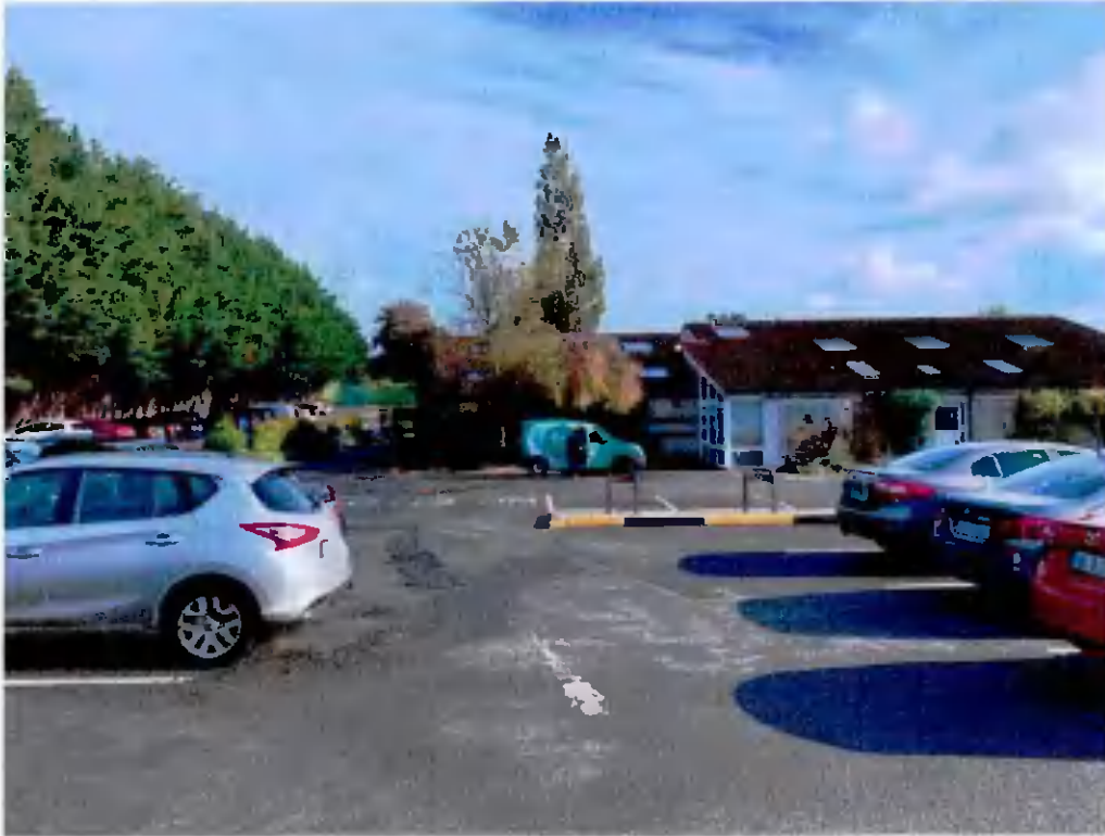
Existing View of entrance from Car Park