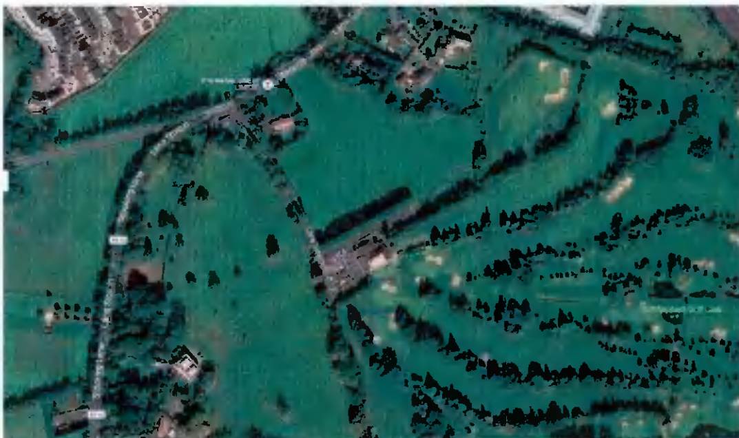
Aerial View of Property

Registered Office: 11 Priory Avenue, Eden Gate Delgany, Co. Wicklow Registration no. 492674