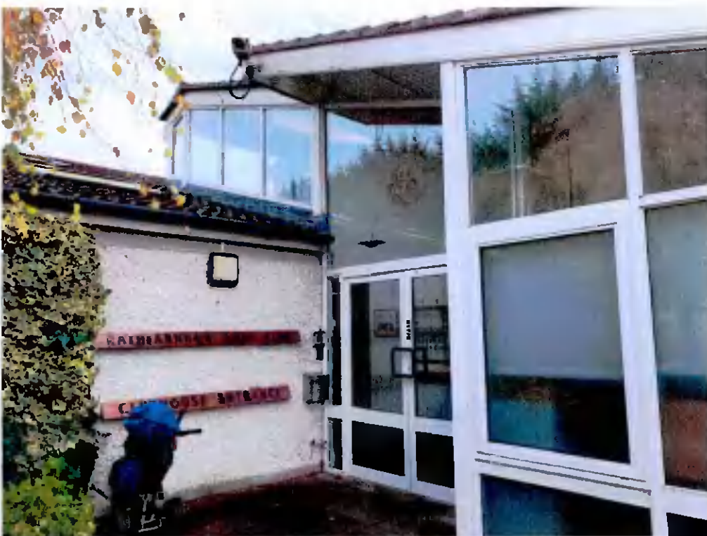
View of Existing Entrance Doors.