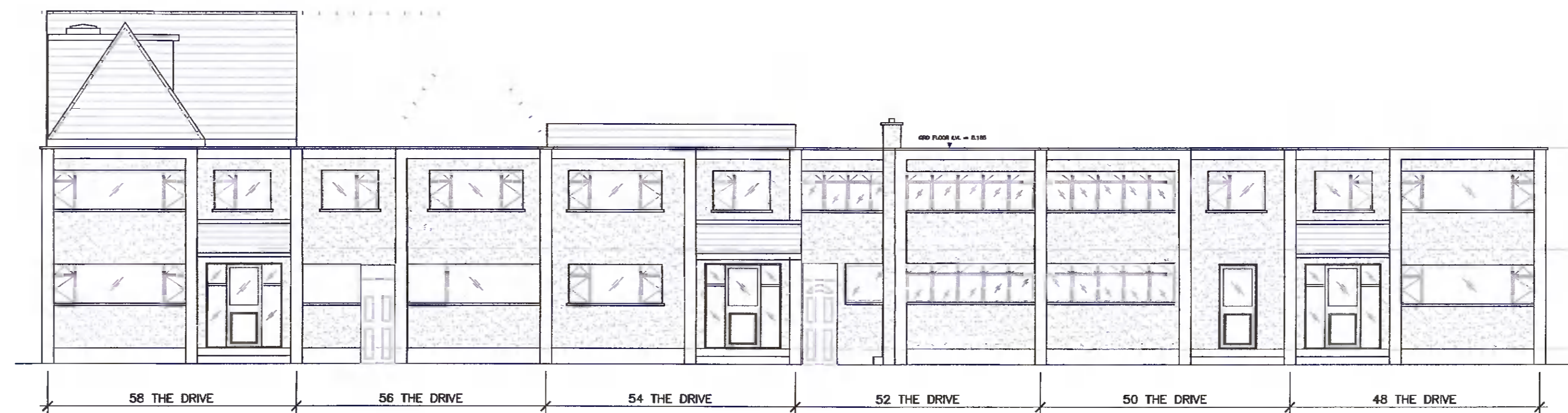
EXISTING CONTINUOUS FRONT ELEVATION SCALE 1:100