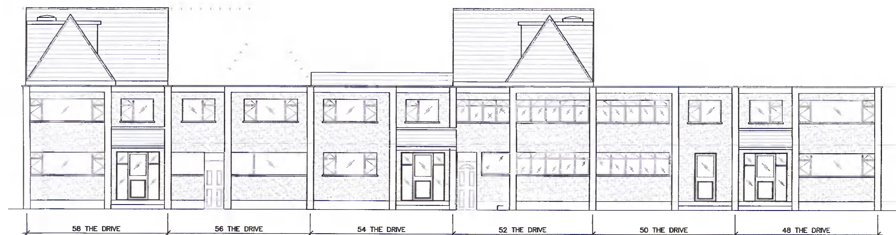
PROPOSED CONTINUOUS FRONT ELEVATION SCALE 1:100