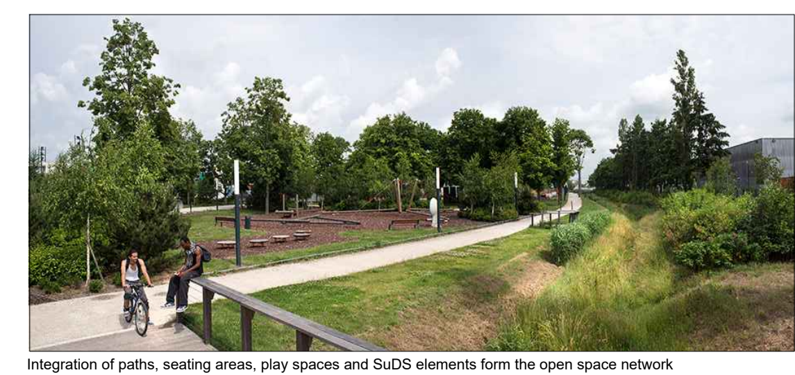
Integration of paths, seating areas, play spaces and SuDS elements form the open space network