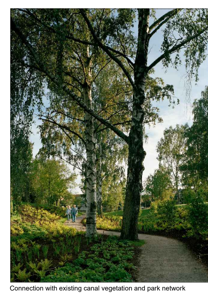
Connection with existing canal vegetation and park network