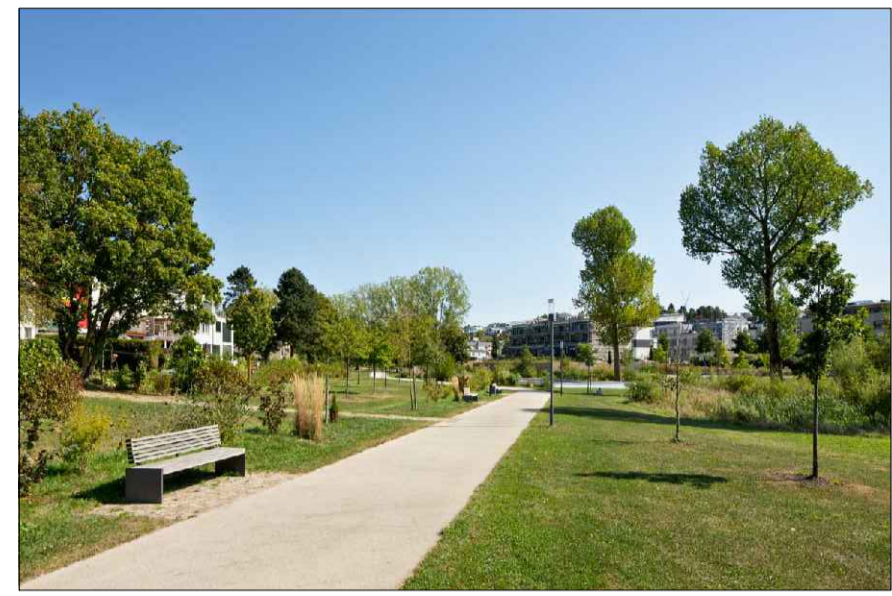
Footpath extends into open space from urban edge