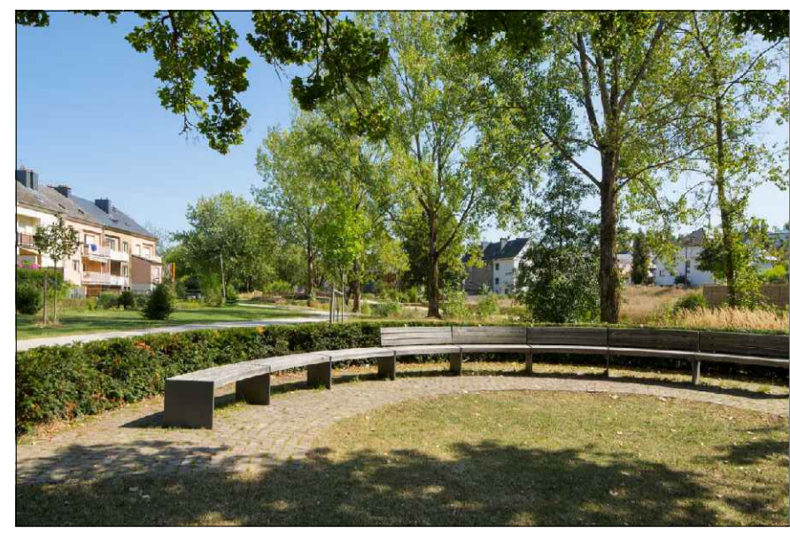
Informal seating spaces within canal open space