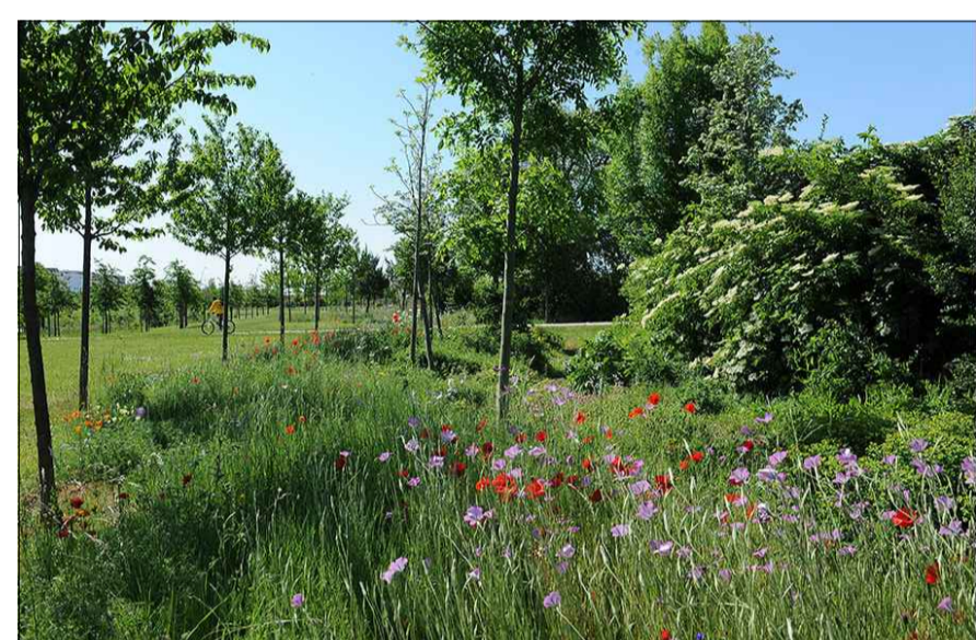
Planted swale edges road to canal open space