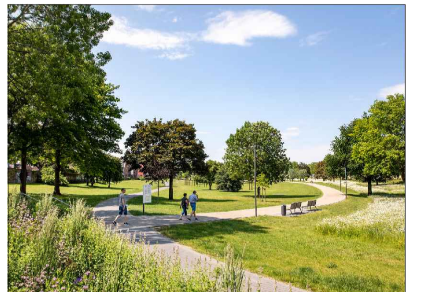
Areas of green open space within canal landscape for informal play

NOTES: 1. This drawing is intended to show landscape architectural proposals only. Please refer to Architects and Engineers drawings for relevant details of buildings, structures, roads, parking, etc. 2. The copyright of this drawing is vested with Murray & Associates. This drawing may not be copied or reproduced without written consent. 3. All materials referred to on this drawing - including plant species - are indicative and subject to change following detailed site investigation. Significant changes, if any are required, will be referred to the relevant authority for agreement. 4. This drawing is not suitable for use for construction purposes. 5. Discrepancies to be referred to Murray & Associates for clarification.