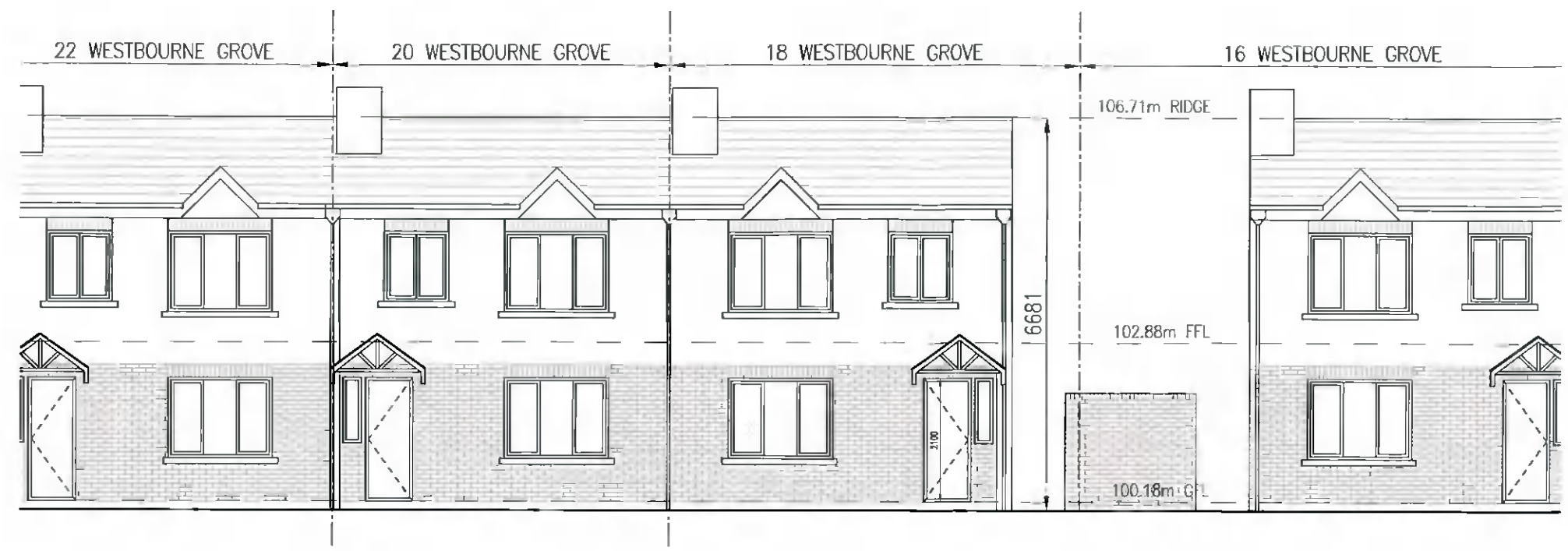
EXISTING FRONT CONTIGUOUS ELEVATION (SOUTH) SCALE 1:100